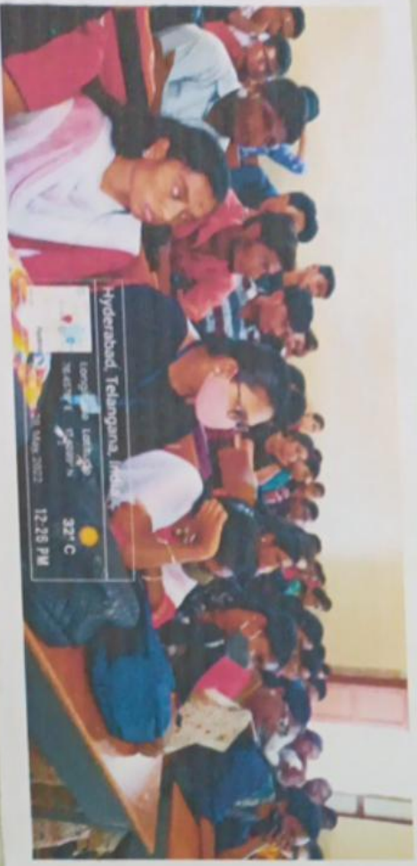
Students participated in the programme