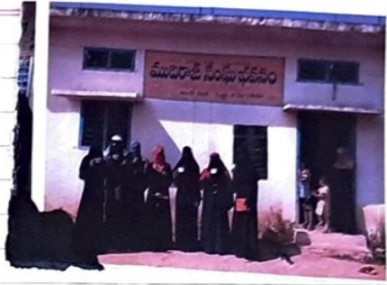
Students at Aangamwadi Centre Shakarnagar BDN.