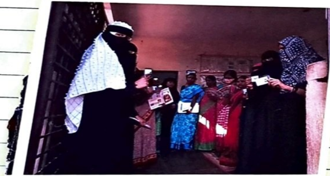
Students asking the details about Centre