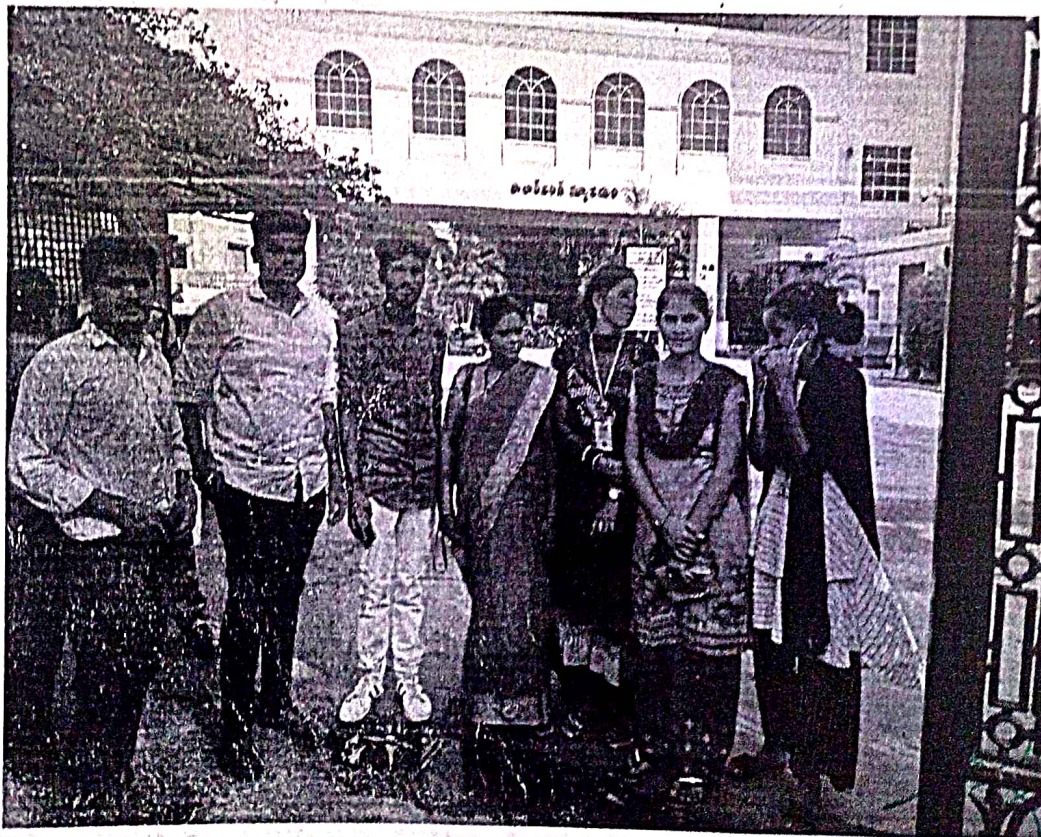
Students and staff visited Salarjung Museum. PRINCIPAL S.R.N.K. Govt. Degree College BANGALURU - 560 018