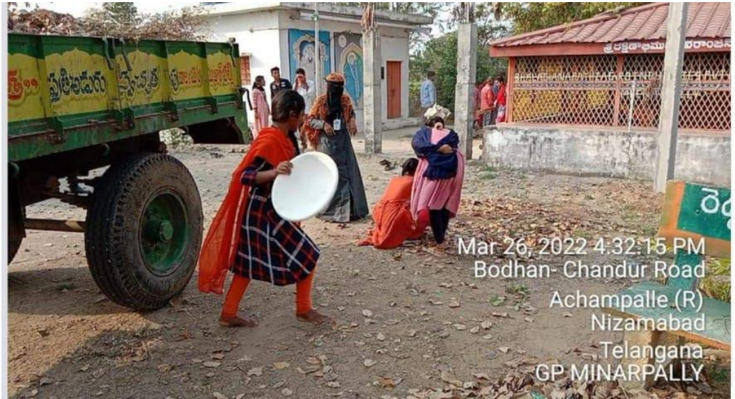
Mar 26, 2022 4:32:15 PM Bodhan- Chandur Road Achampalle (R) Nizamabad Telangana GP MINARPALLY