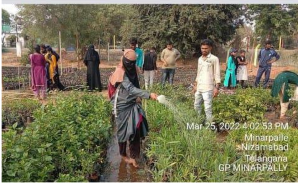
Mar 25, 2022 4:02:53 PM Minarpalle Nizamabad Telangana GP MINARPALLY