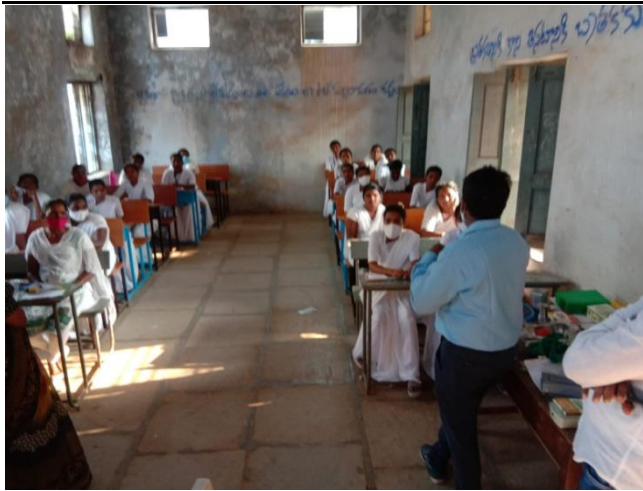
STUDENTS AWARENESS WORKSHOP ON 24-3-22 AT GJC PARKAL