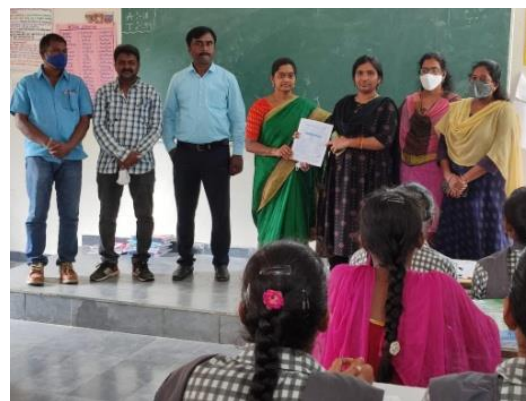
STUDENTS AWARENESS WORKSHOP ON 26-3-22 AT KGV B THIRUMALAGIRI

Principal GOVT. DEGREE COLLEGE Parkal Hanumakonda