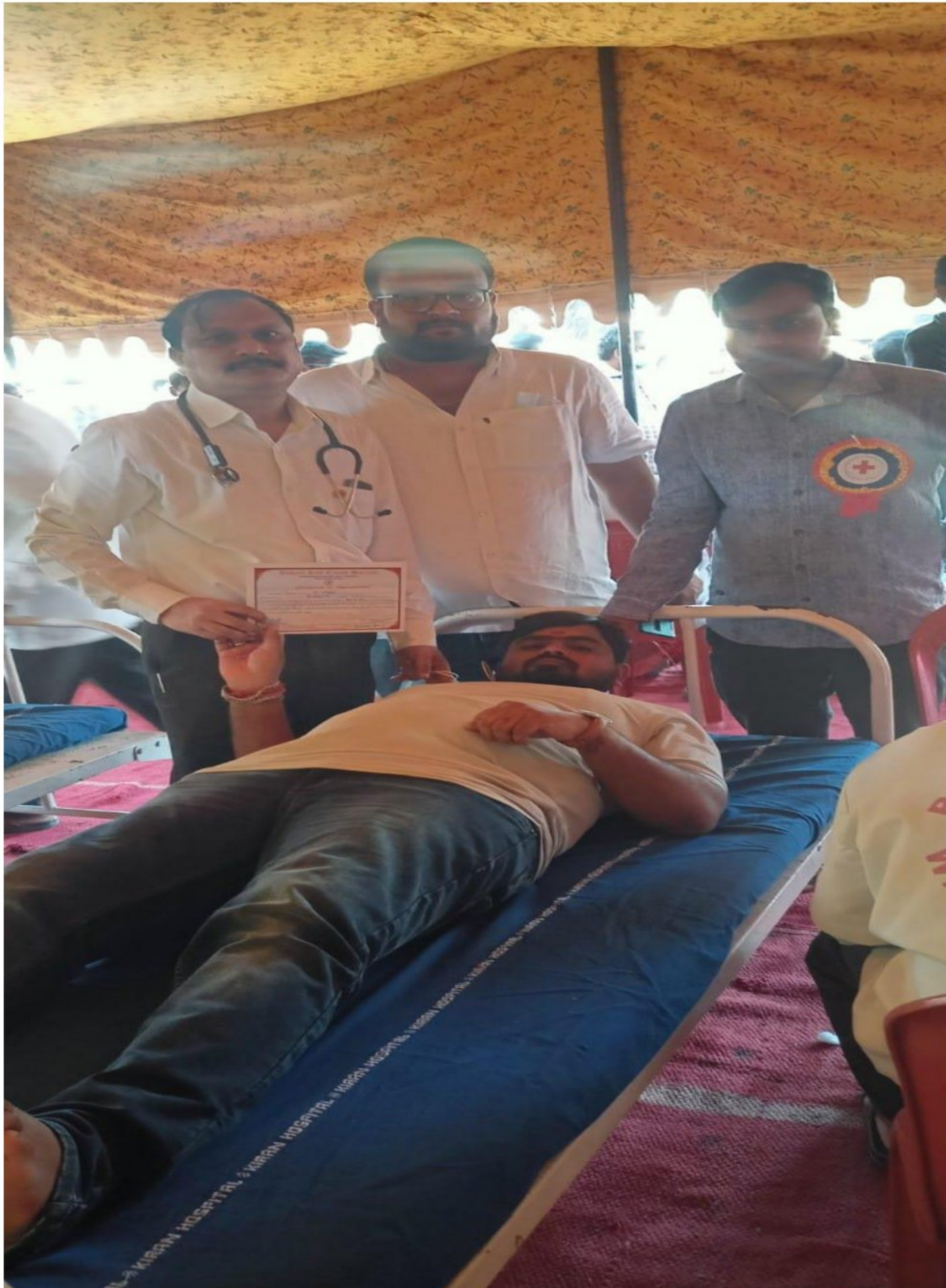
Blood donation camp conducted by Red cross society on 24 January 2021