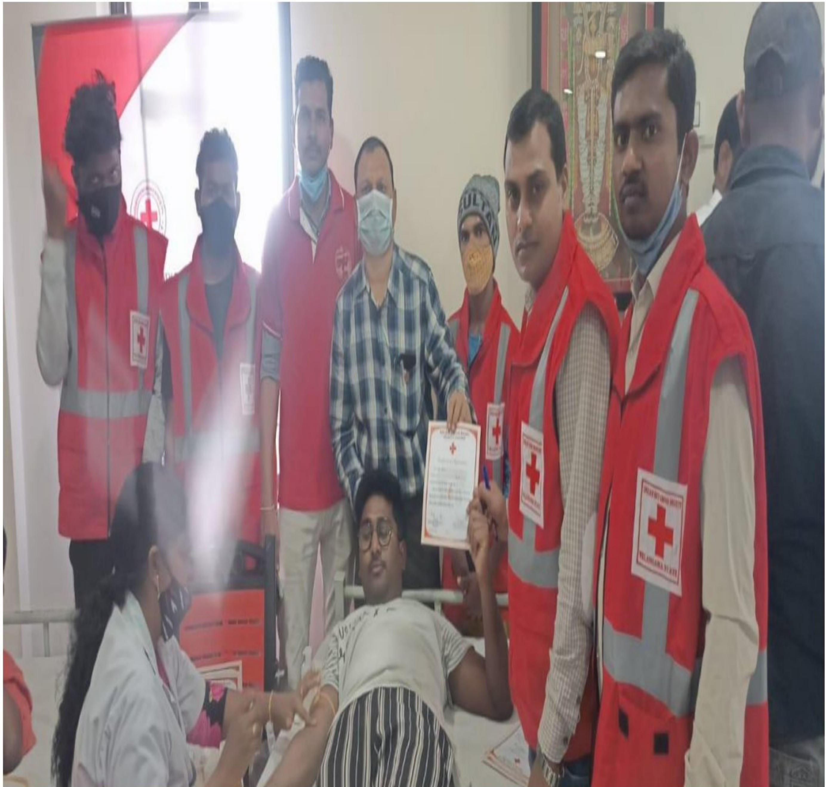
Blood donation by students collaboration with Red cross society 24January 2022