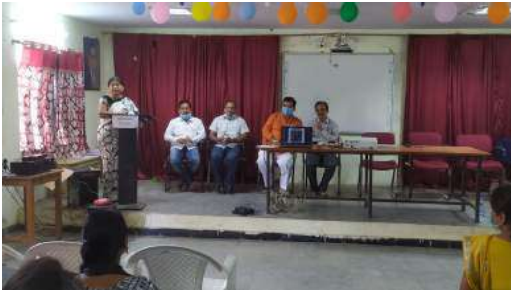
Certificate Distribution Ceremony