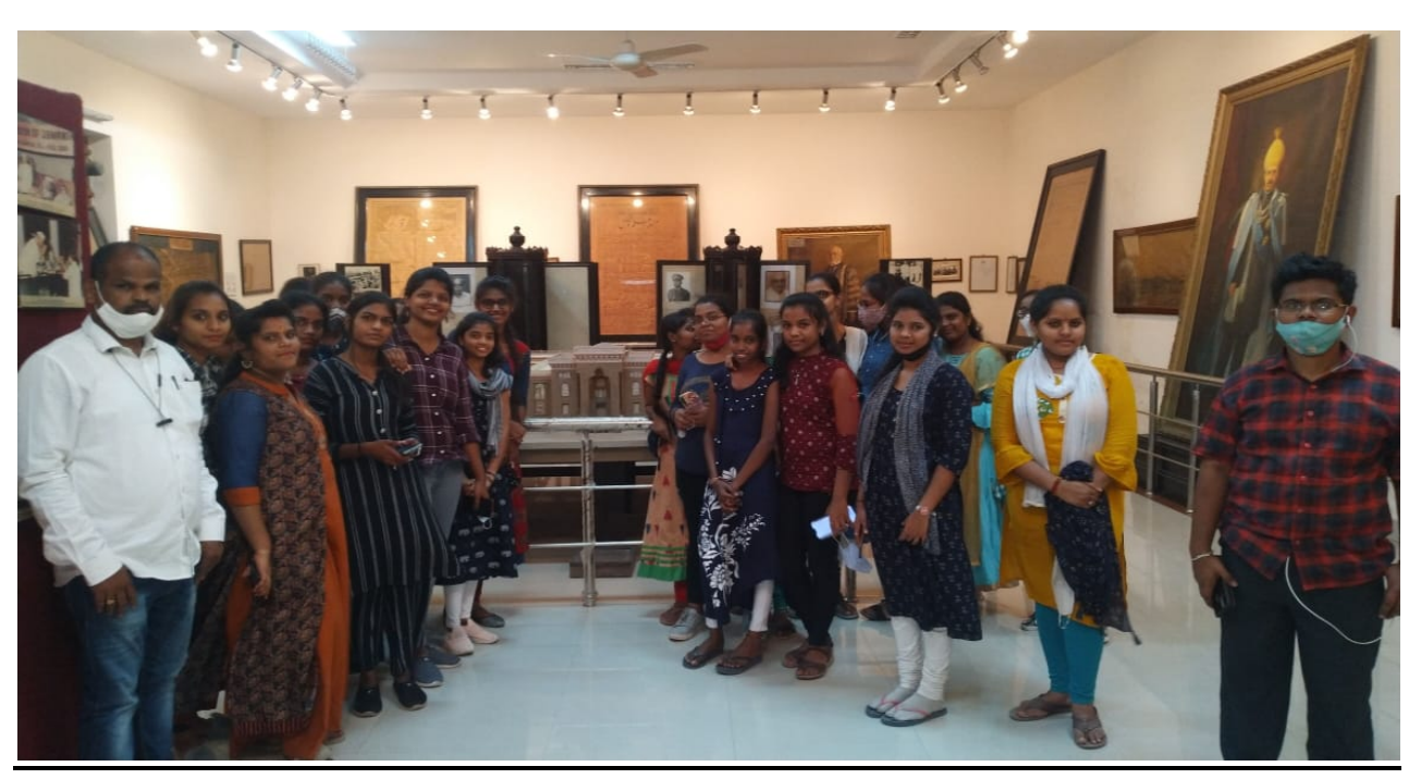
<u>Visited to Main Library, Arts College Library and Sanskrit Academy in</u> <u>Osmania University, Hyderabad</u>