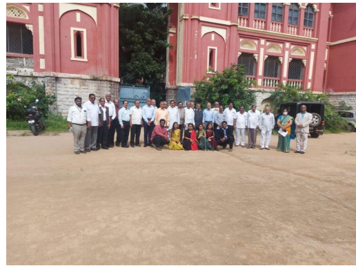
Alumni Meet during Autonomy Extension Team Inspection