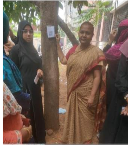
Displayed the QR Codes for plants