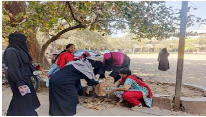
Dry leaf collection