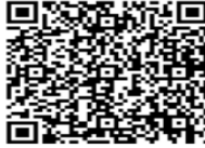
Kalanchoe pinnata (Lam.) Pers