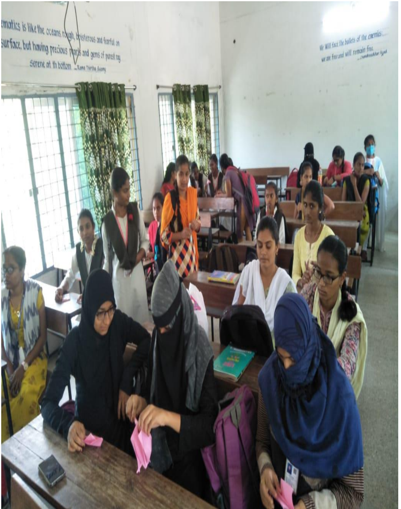
Students are preparing the articles with the drawing paper peaces