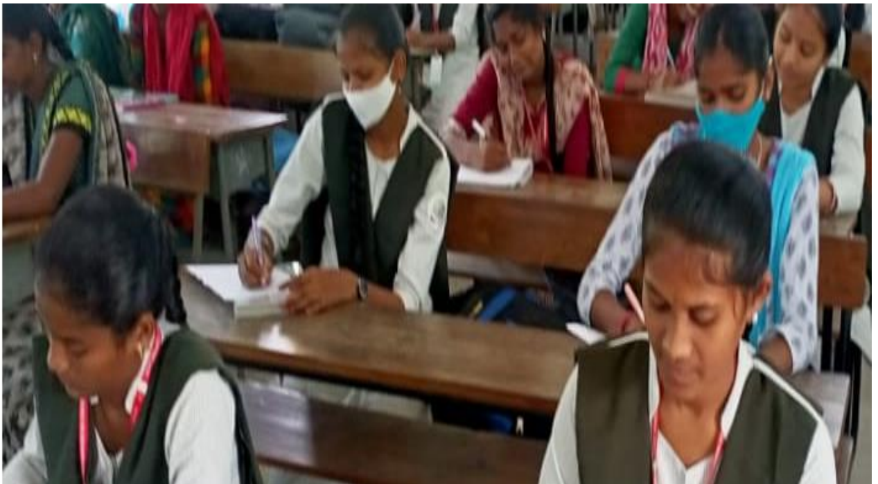
Essay writing competition