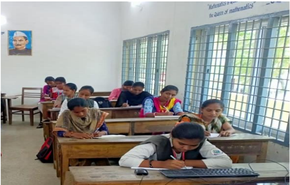
Essay writing competition