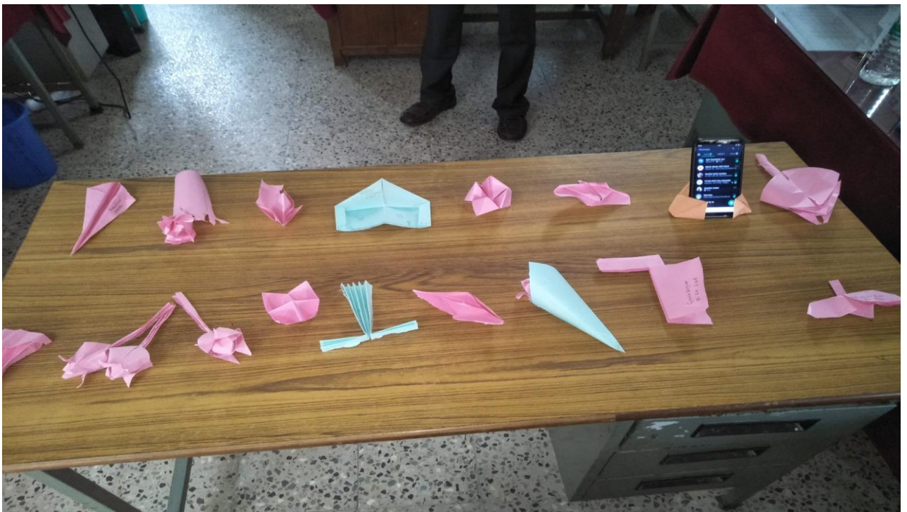
Different types of articles made by the students by using the peaces of drawing sheet