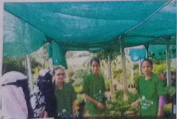
Yenugonda, Telangana, India 4-2/2, SVS Medical Hospital, Yenugonda, Telangana 50900 India Lat 16.757797° Long 78.038678° 07/12/21 02:25 PM