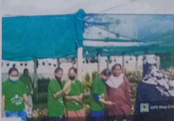
Yenugonda, Telangana, India 4-2/2, SVS Medical Hospital, Yenugonda, Telangana 50900 India Lat 16.757807° Long 78.038564° 07/12/21 02:18 PM