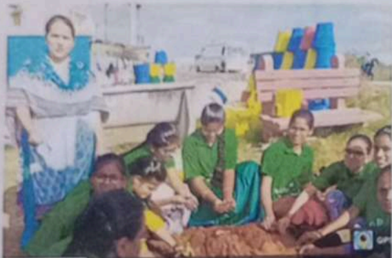
Yenugonda, Telangana, India Q25Q+3FM, Yenugonda, Telangana 50900 Lat 16.7577° Long 78.038652° 07/12/21 03:02 PM