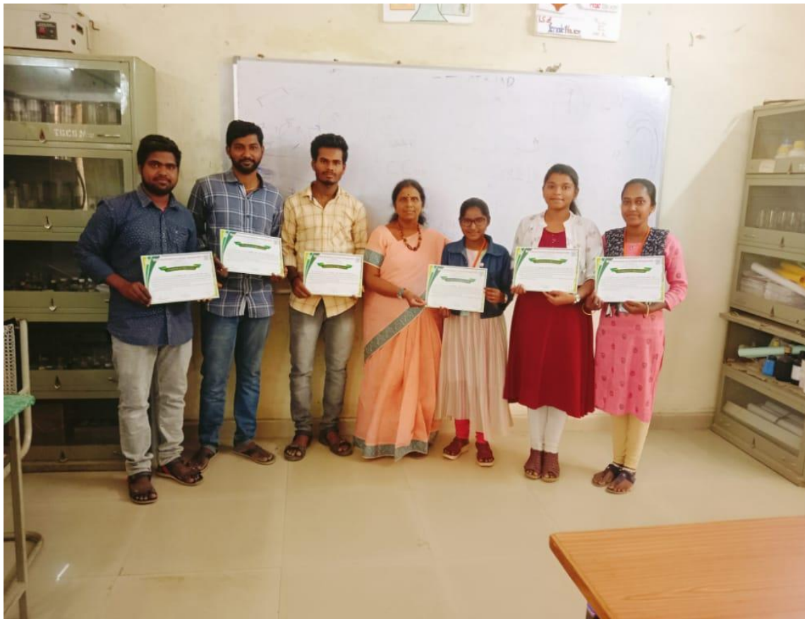
Certificates given to the students