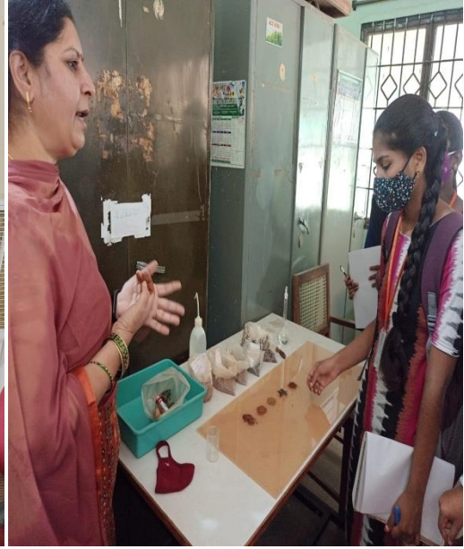
Training the Students