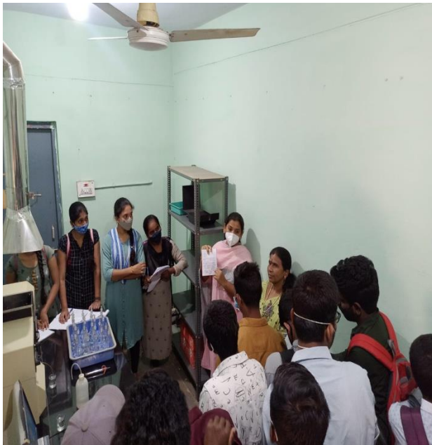
Training the Students