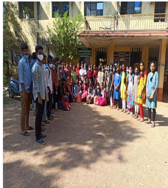
Soil Testing Lab, Sangareddy