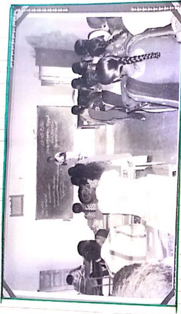
2021-2022 ವಿದ್ಯಾರ್ಥಿನ ಸಮಿನಾಡ್ - 2