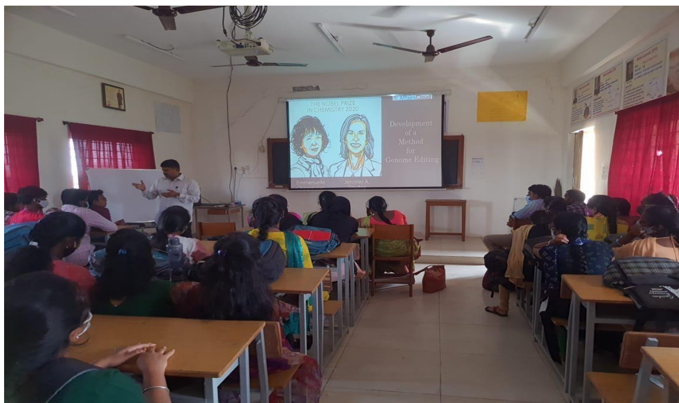
Department of Chemistry, South Campus, Telangana University, Bhiknoor. Research Lab