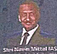
Shri Navin Mittal IAS Commissioner, Collegiate & Technical Education