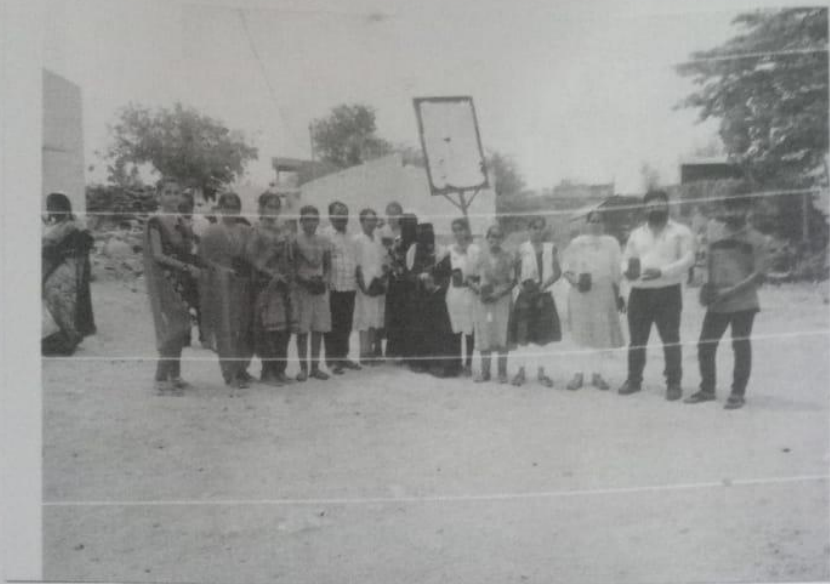
4 ಶಿಕ್ಷಣದ ಸಂಪನ್ಮೂಲಗಳನ್ನು (ಸಂಪನ್ಮೂಲ) ನೀಡುವ Special Camp ಆಯೋಜನೆ.