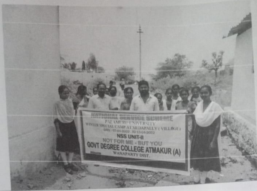
" ఈ ఏ పట్ల ప్రజాసేవ కార్యక్రమం పాల్గొన్న వ.స.స. Volunteers