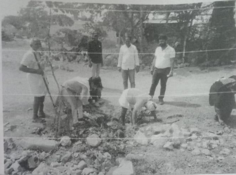
ಮೂಲ ಸಂಸ್ಥೆ ಕಾರ್ಯಕ್ರಮದ ನಿಸ್ಸಿ ವೋಲ್ಟಿಯರ್ಸ್

PROPR... OFFICE ... UNIT-1/ S.D.C. ADDRESS (A) 560024