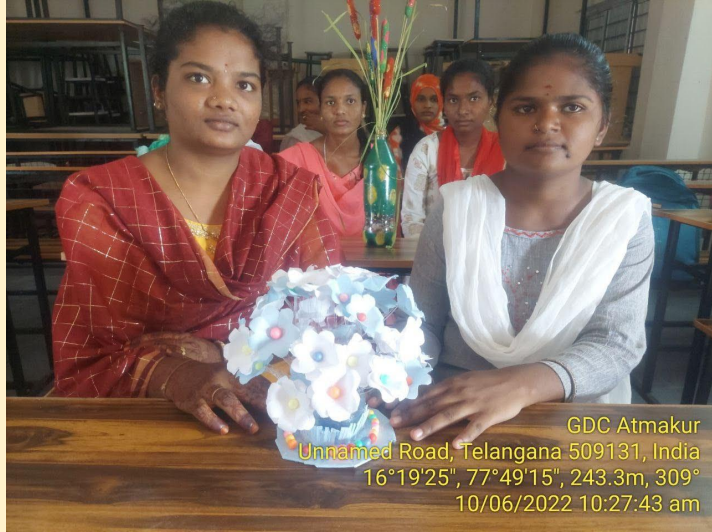
GDC Atmakur Unnamed Road, Telangana 509131, India 16°19'25", 77°49'15", 243.3m, 309° 10/06/2022 10:27:43 am