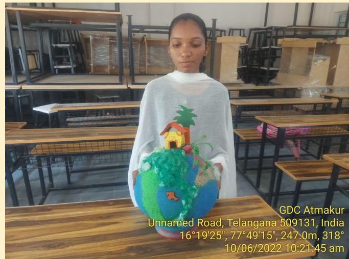
GDC Atmakur Unnamed Road, Telangana 509131, India 16°19'25", 77°49'15", 247.0m, 318° 10/06/2022 10:21:45 am