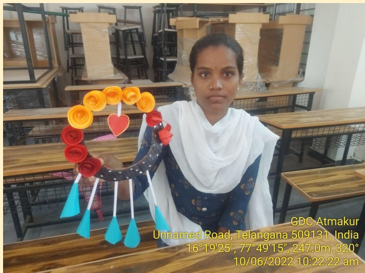
GDC Atmakur Unnamed Road, Telangana 509131, India 16°19'25", 77°49'15", 247.0m, 320° 10/06/2022 10:22:22 am