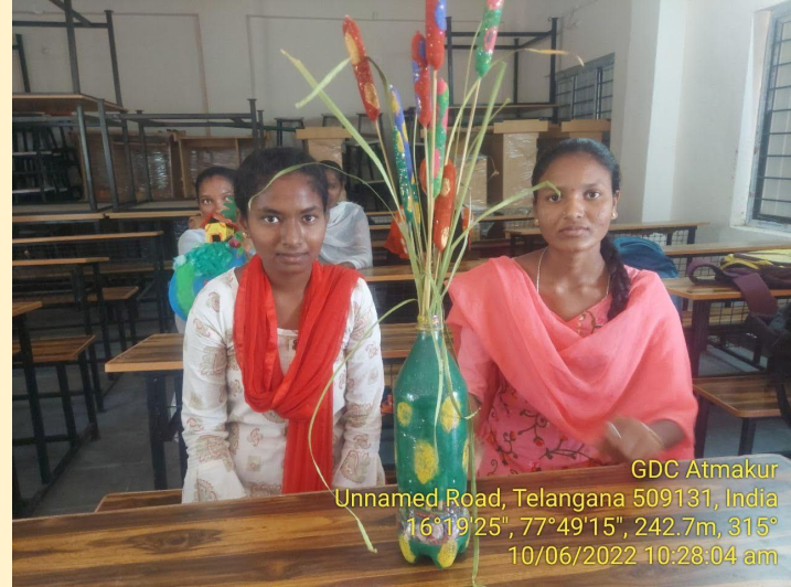
GDC Atmakur Unnamed Road, Telangana 509131, India 16°19'25", 77°49'15", 242.7m, 315° 10/06/2022 10:28:04 am