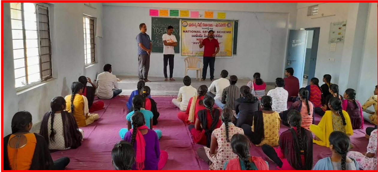
Staff and the students doing different asanas on this occasion.