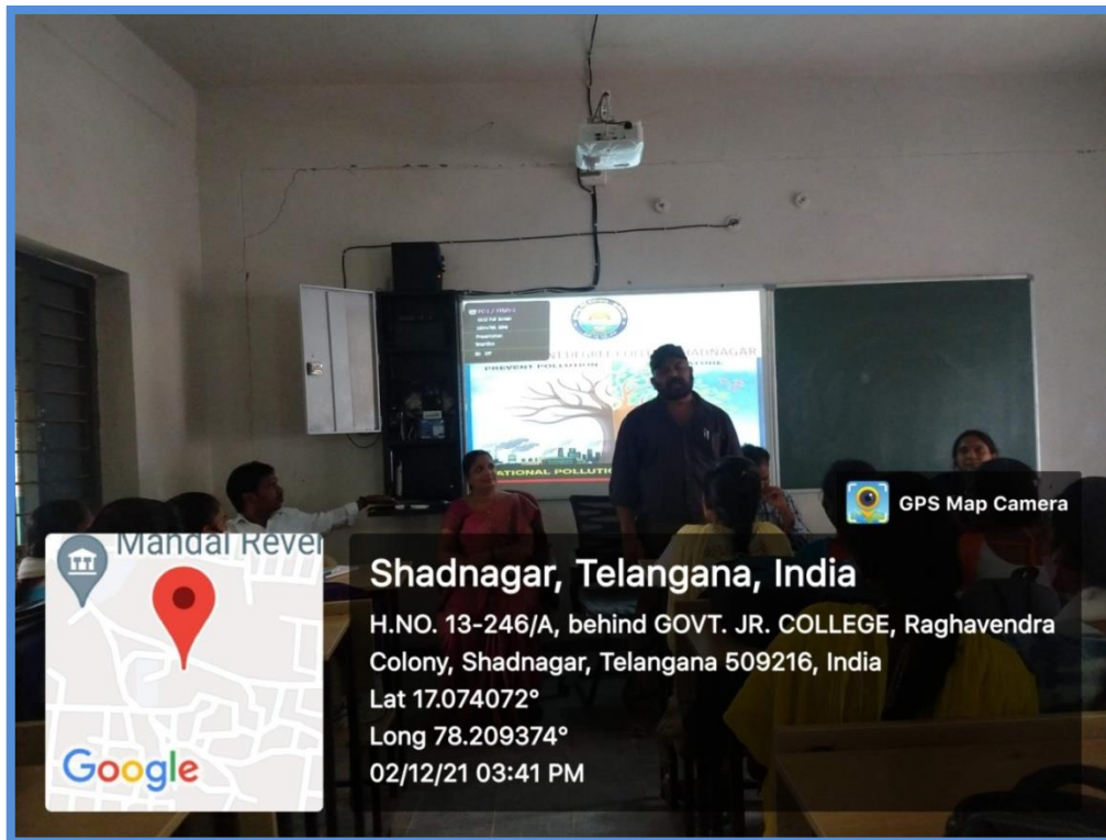
Principal Sri Bhanu Prakash garu giving speech.

Pollution Control Day conducted on 2/12/21