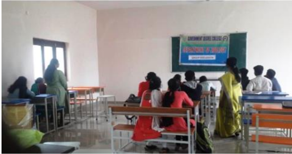
Group Discussion conducted on 14-11-2022