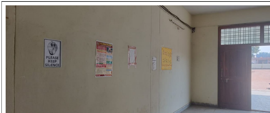
Silence Boards in College Premises