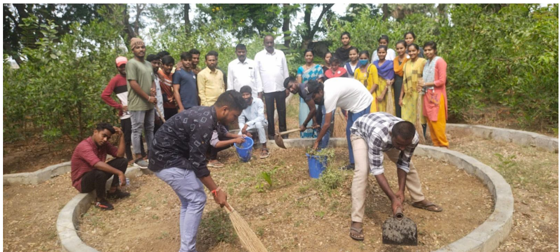
Clean and Green Program in Bhupalpally Town-2019