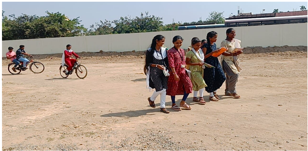
Students are attending college by bicycles and on Foot