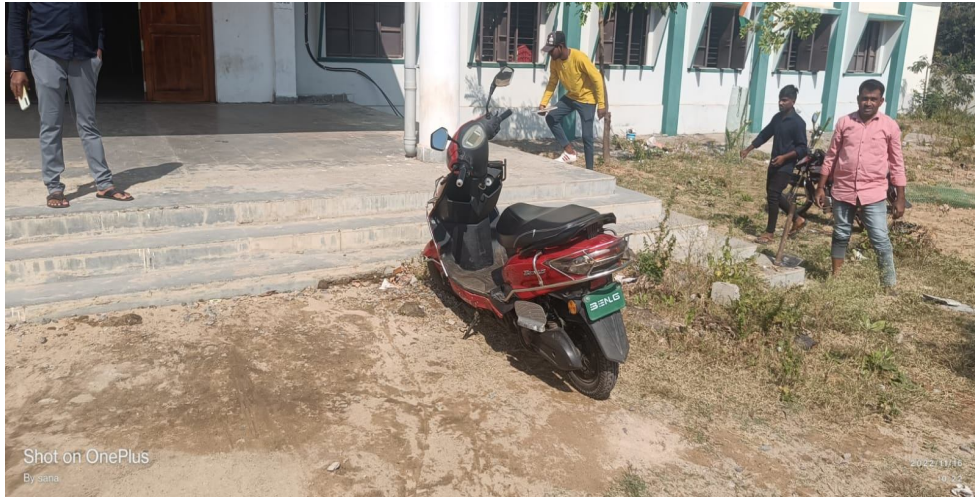
Staff attending college on Battery Powered Vehicle