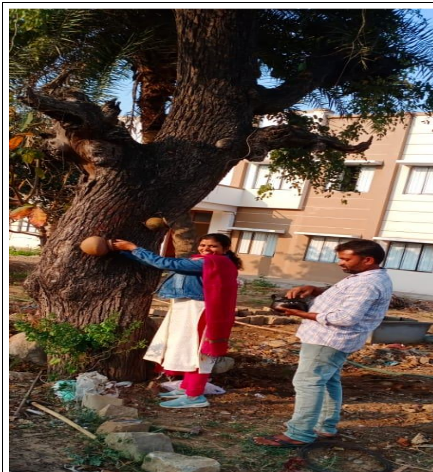
Arranged grains and water for Birds