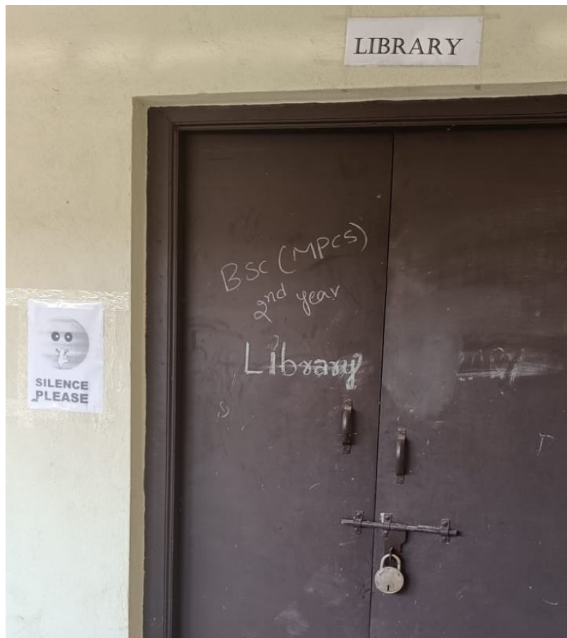
Silence Boards in College Library Premises