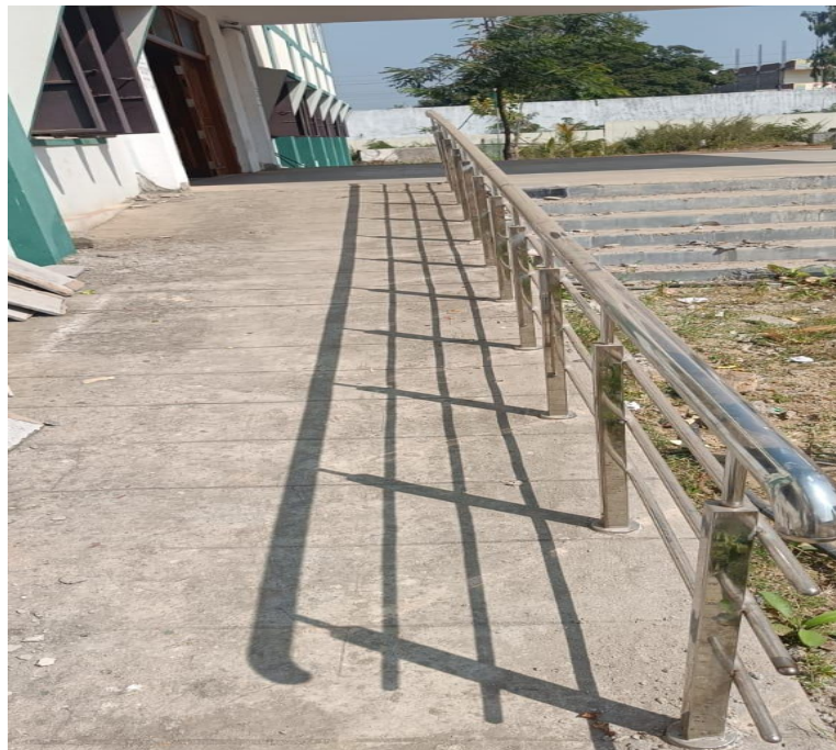
Ramp available for Divyang Jan