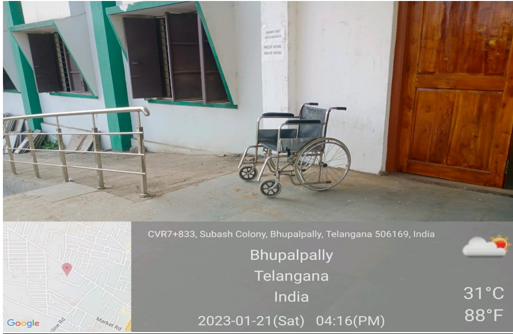
Wheel chair Available for Divyangjan