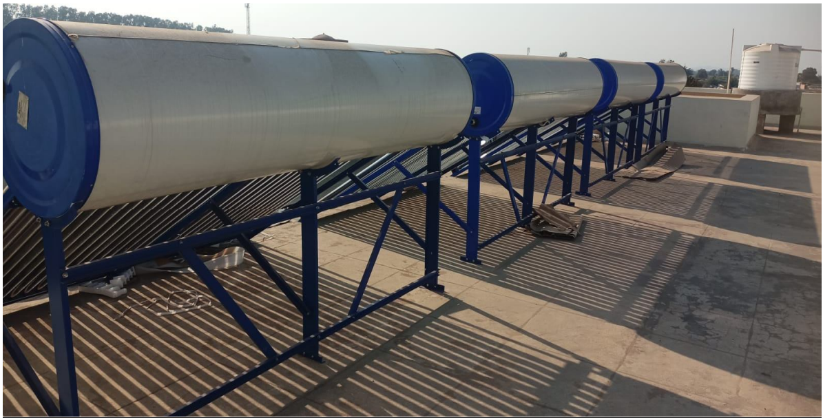
SOLAR PANELS FIXED FOR COLLEGE POWER