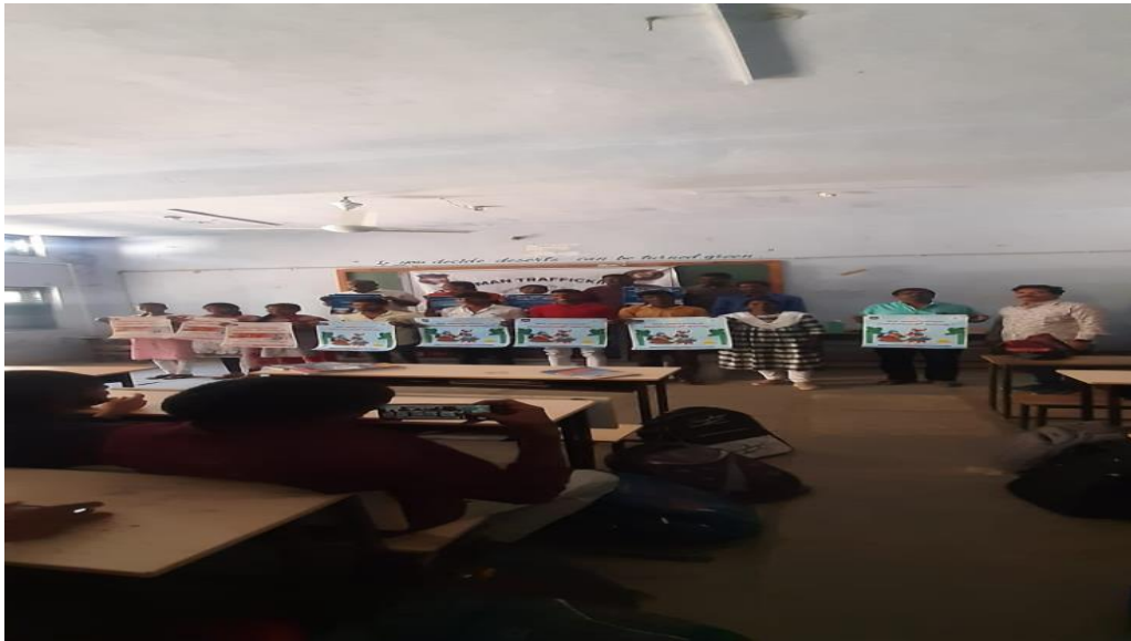
Display of posters to the students