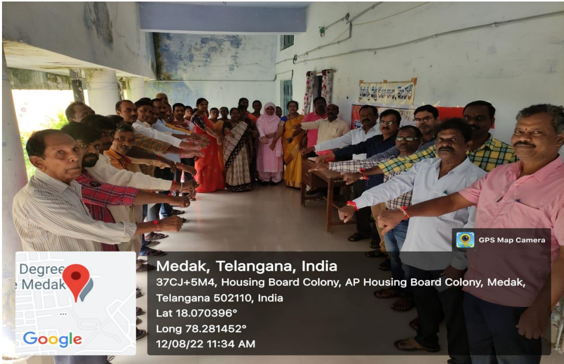
Teaching & Non-teaching staff with Rakhis