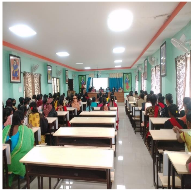
Students sharing their experiences