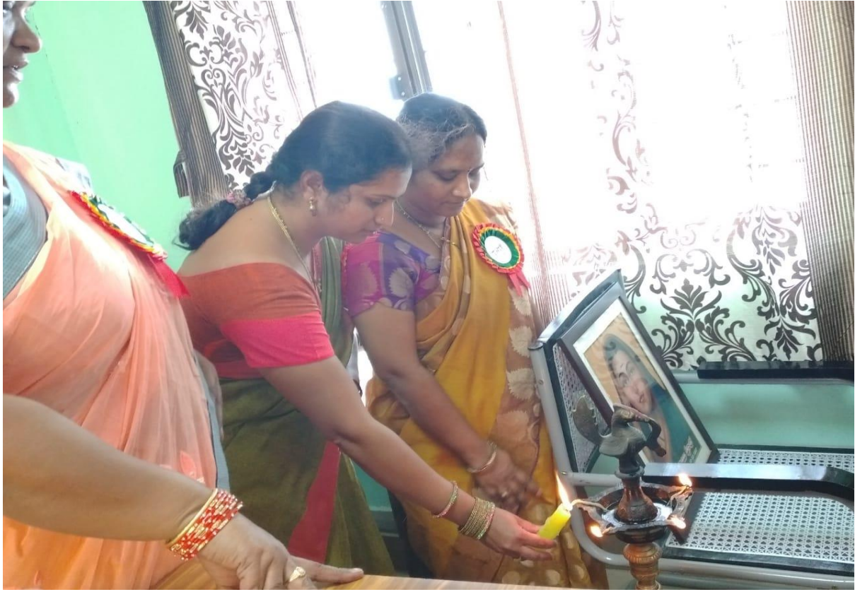
Candle lightening by the guests & WEC members