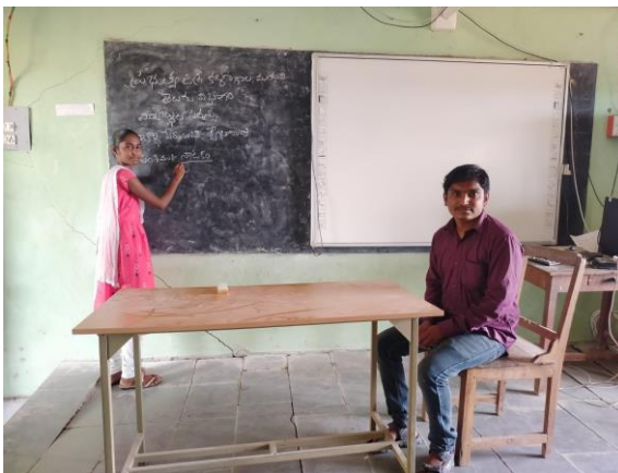
Dept of Telugu STUDENT SEMINAR