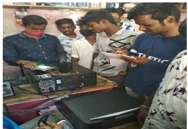
Dept of Physics Field Trip to Gayathri Hardwares