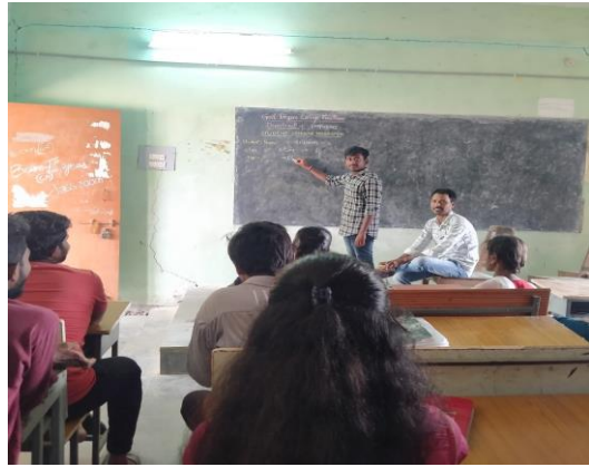
Dept. Of Computers STUDENT SEMINAR