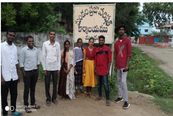
Dept. Of Pol Science Field Trip to MPDO Office