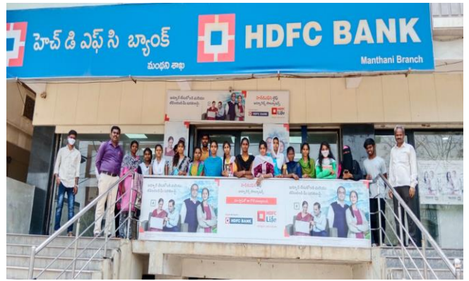
Dept. Of Commerce Field trip to HDFC Bank