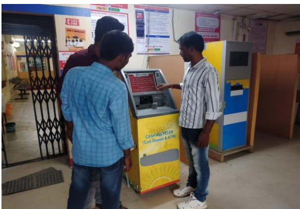
Dept. Of Computers Field Trip to ATM Centre