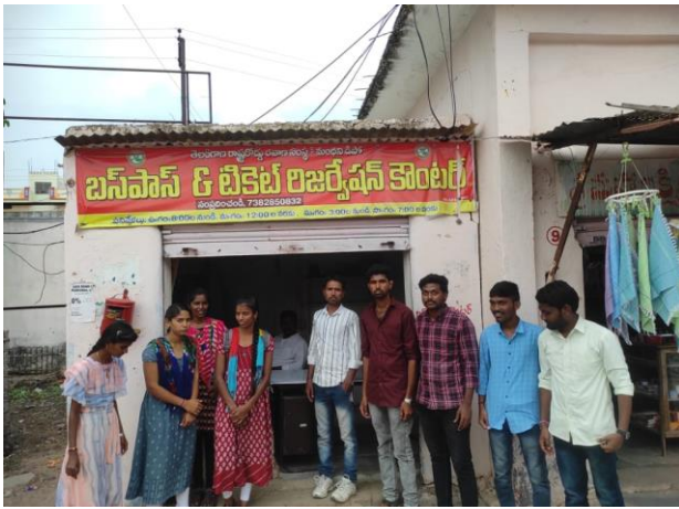
Dept. of Computers Field trip to Ticket Reservation Counter