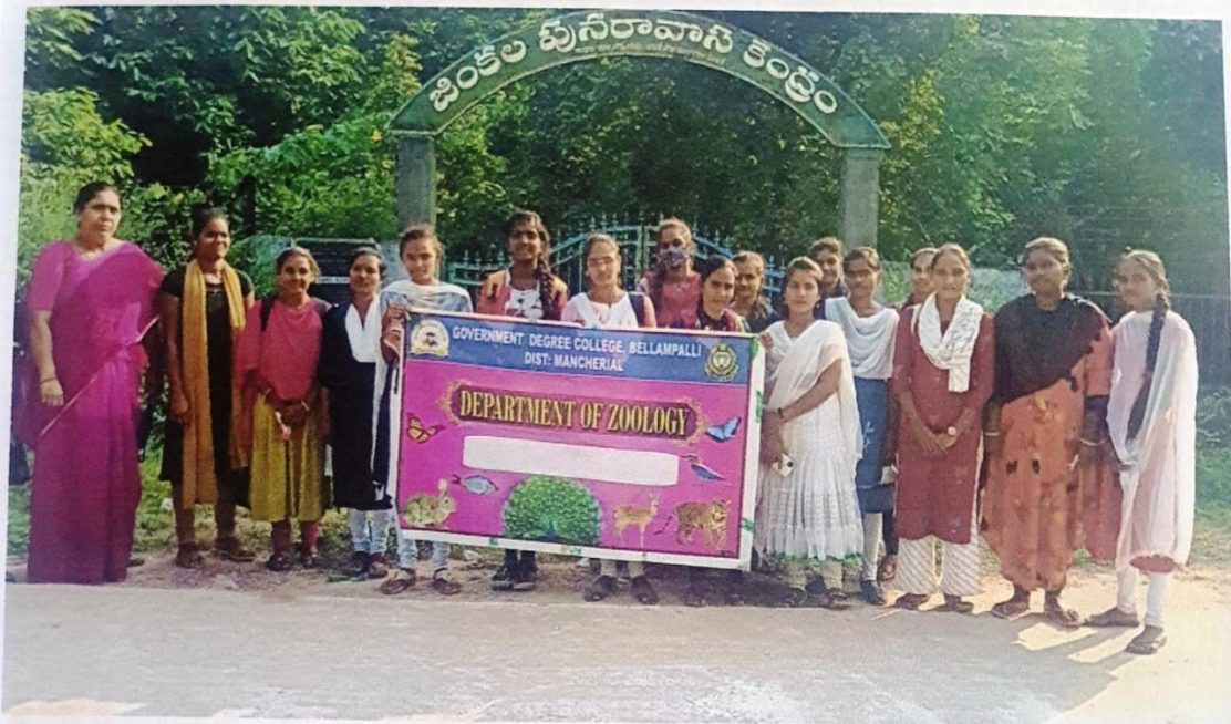
At the Deer Rehabilitation Centre