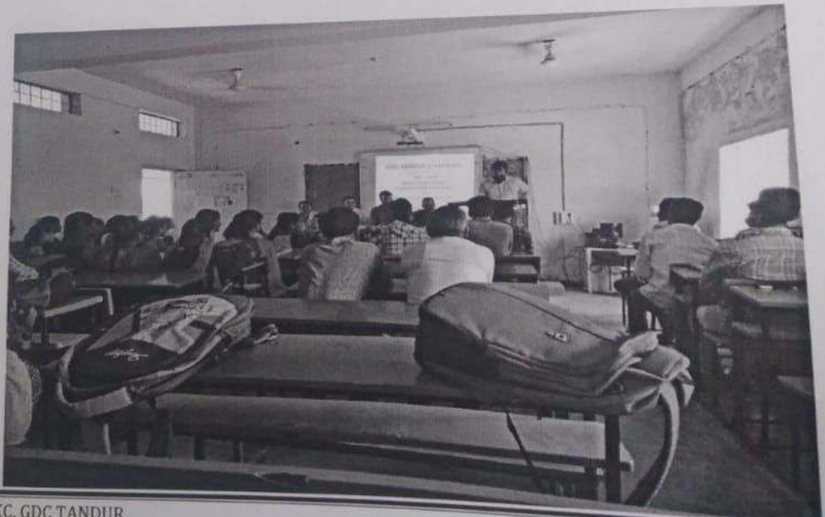
TSKC, GDC TANDUR