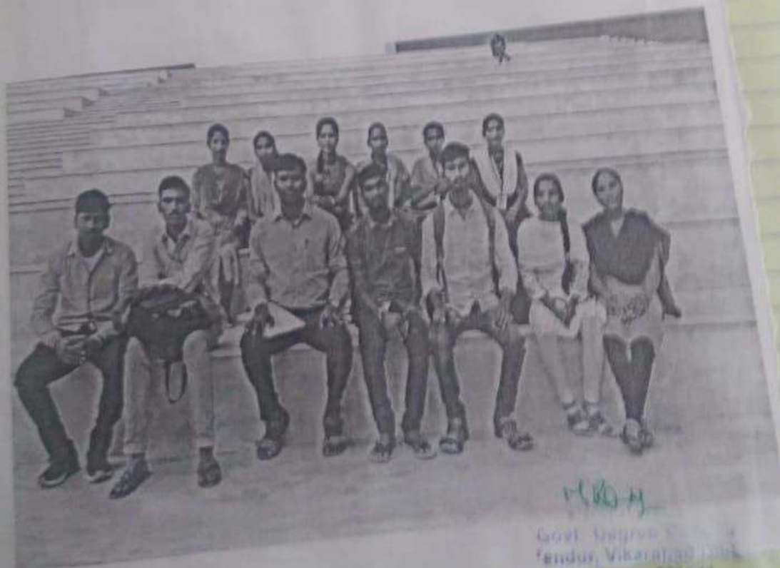
M. B. H. Govt. Degree College Tendur, Vikarabad Dist. Pin Code: 501141