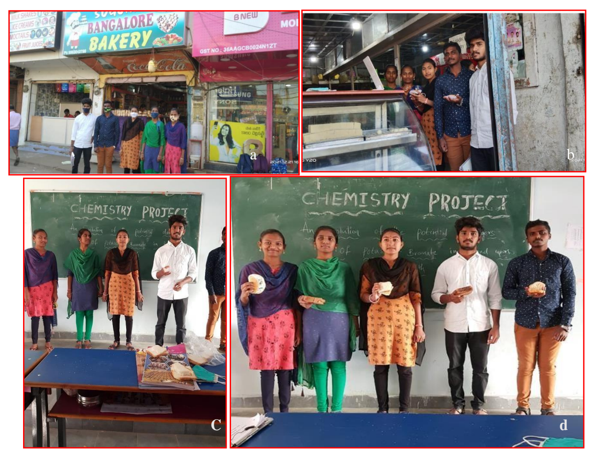
Fig-I a & b Students collected a variety of breads from a bakery in Bhopalpally. C&d Students have taken out bread covers from various types of branded bread and have begun an experiment at Department of Chemistry Bhoopalpally.

buns and pav are little loaves of bread produced from finely milled wheat flour that is devoid of bran, refined, and bleached, as well as other ingredients. Fruit buns are enriched with extra cherries and fruits, which enhance the taste and nutritional value of the product.