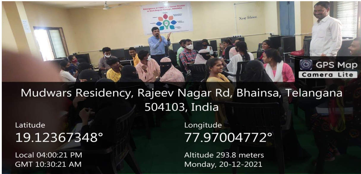
Few pictures on Mahindra Pride Class room Training in TSKC lab of GDC BHAINSA