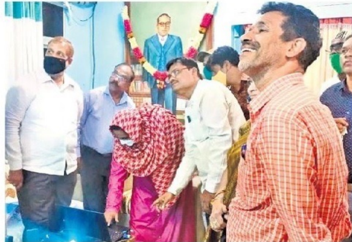
'E-Library Telangana' helps students access two lakh e-books, 9,000 e-journals and info on competitive exams free of cost.

Students can now access thousands of e-books and e-journals and recorded subject lessons through the app. Subject e-books available in the app are not only useful but also helpful financially as the students need not spend money on purchasing textbooks.