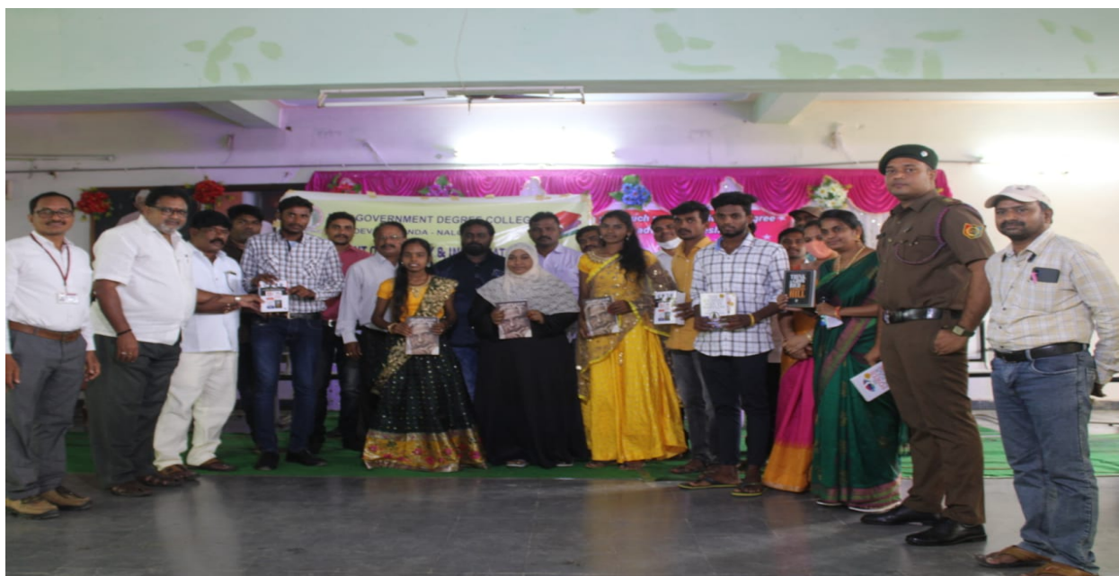
Prize distribution on National Library Week Competitions 2021