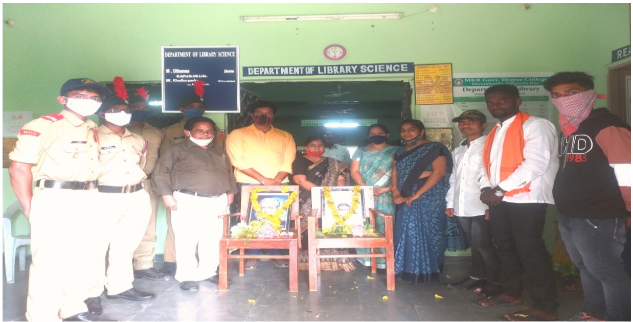
National Library Week 2020