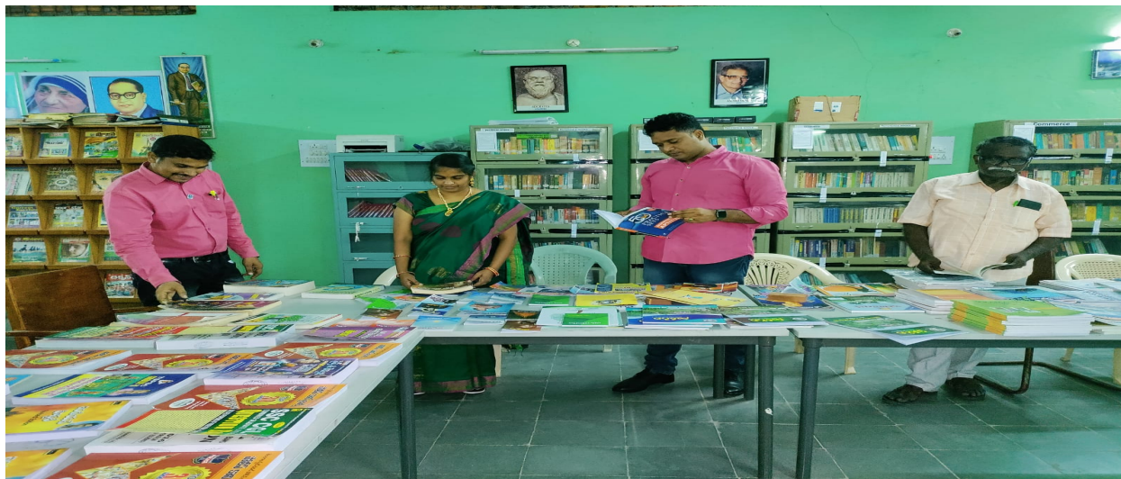
Staff participation in Library week 2021