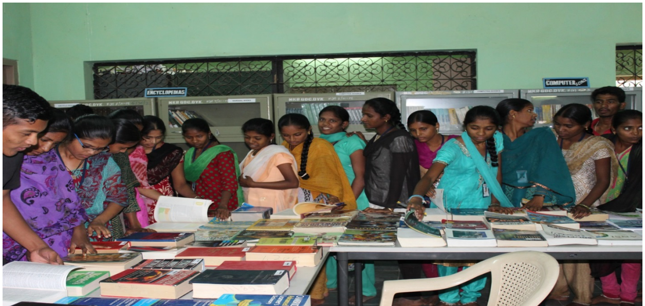
BOOK Exhibition 2019