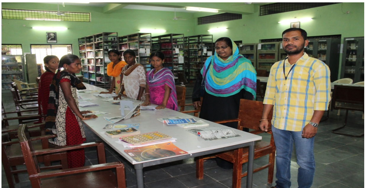
Library Week 2018