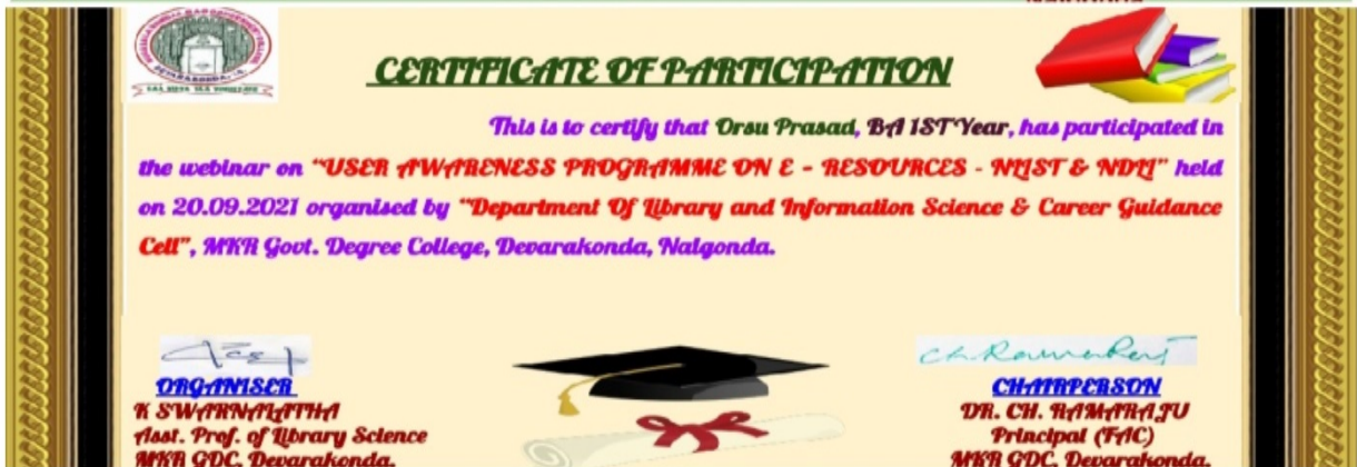
Webinar on User Awareness Program on E-resources NLIST & NDLI