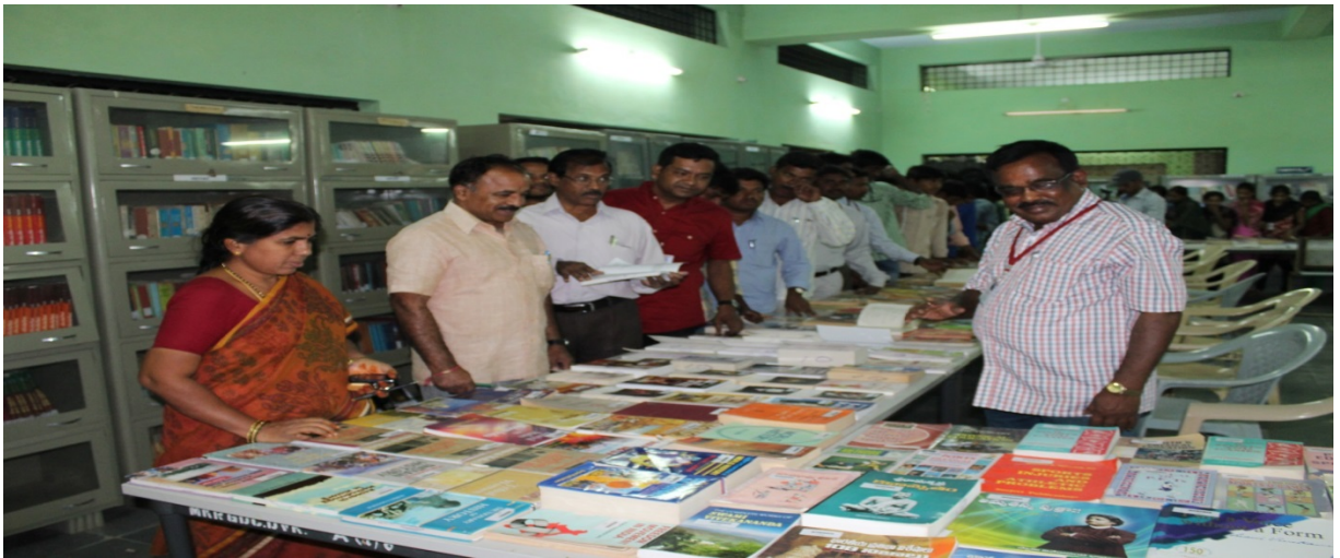
Library week 216