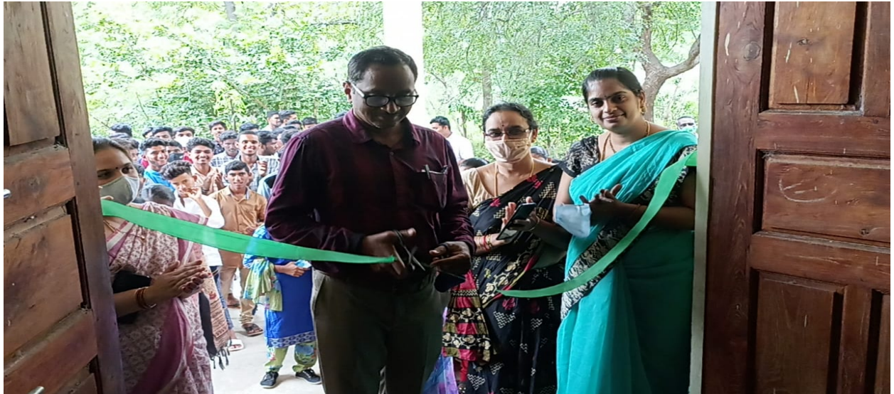
National Library Week 2021