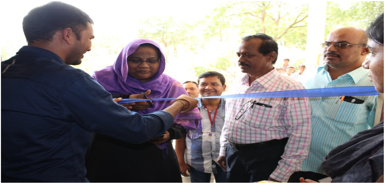
Library Week 2017