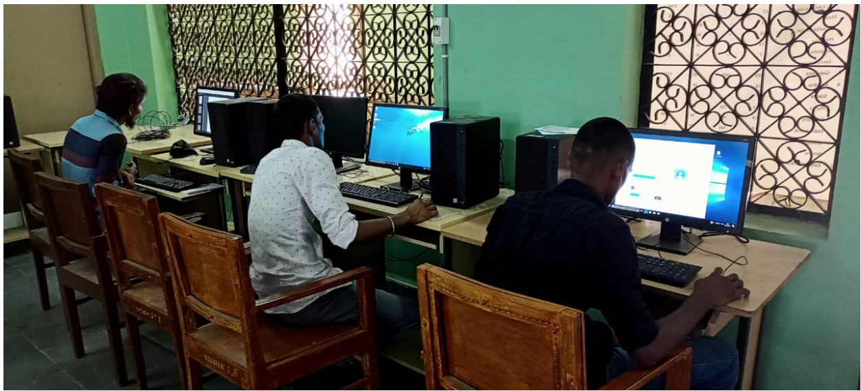
Use of Digital Library