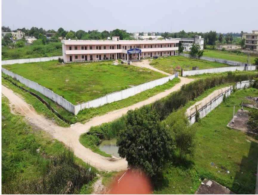
COLLEGE MAIN BULIDING

Website: https://gdcts.cgg.gov.in/thorrur.edu