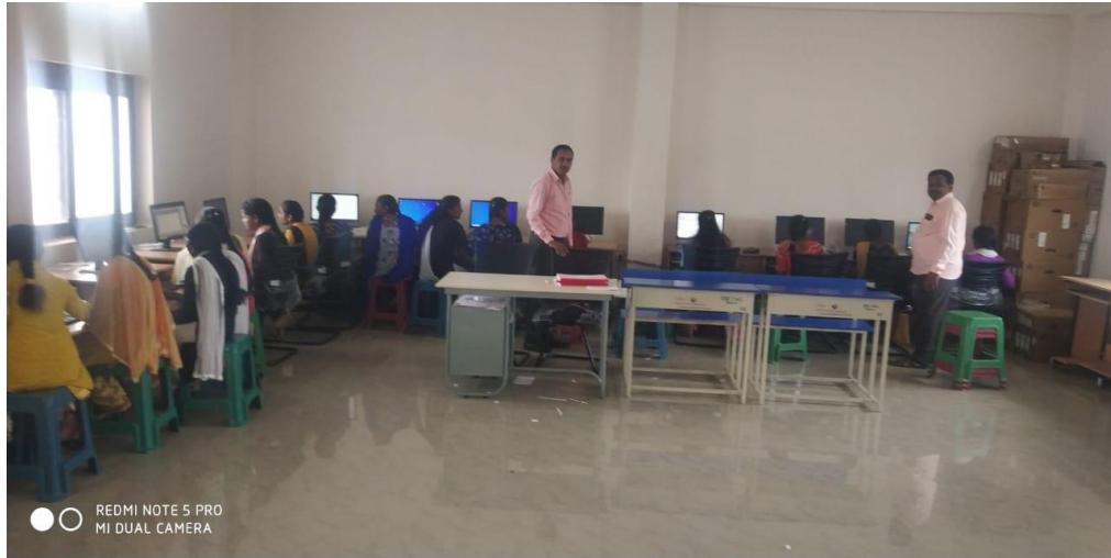
Department of Computer-LAB