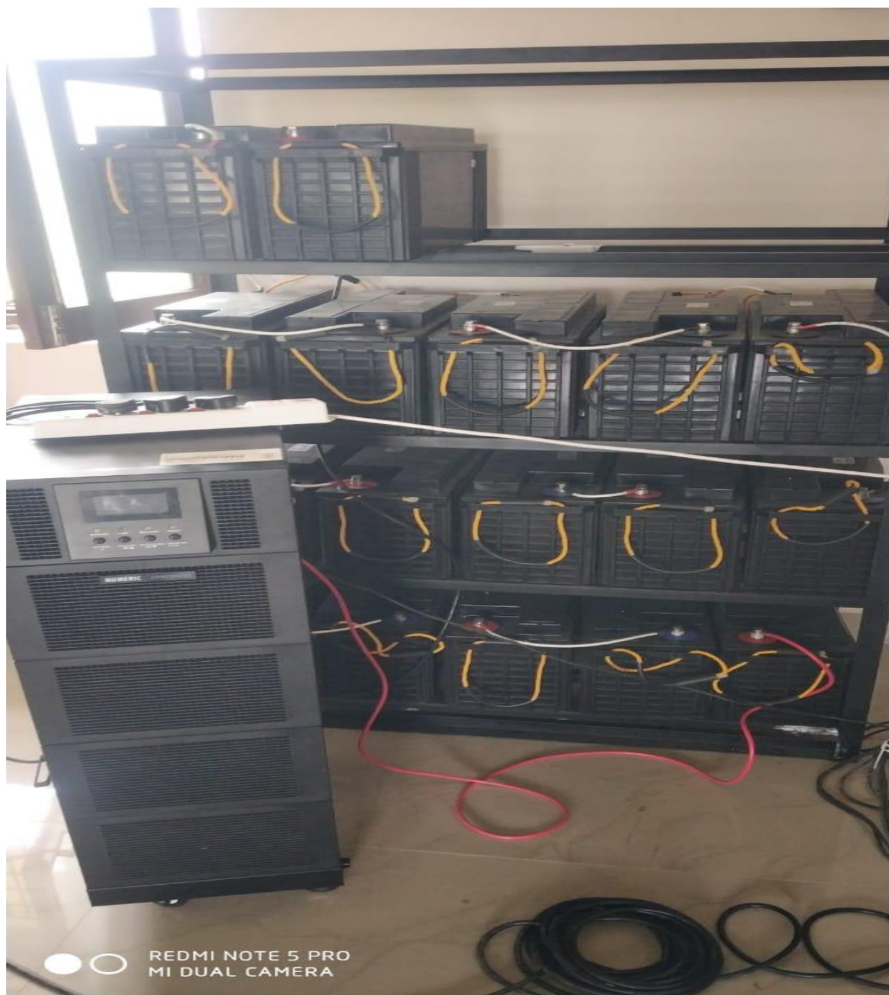
10 KV INVERTERS