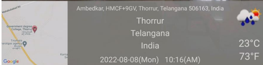
PRINCIPAL OFFICE ROOM