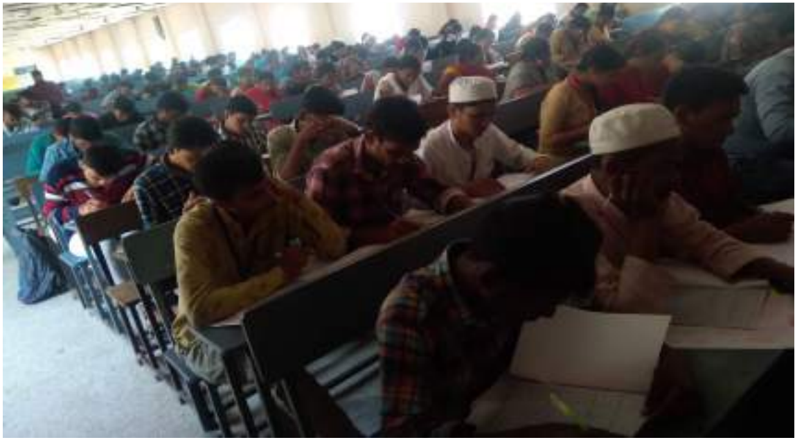
Student Writing Mock Test