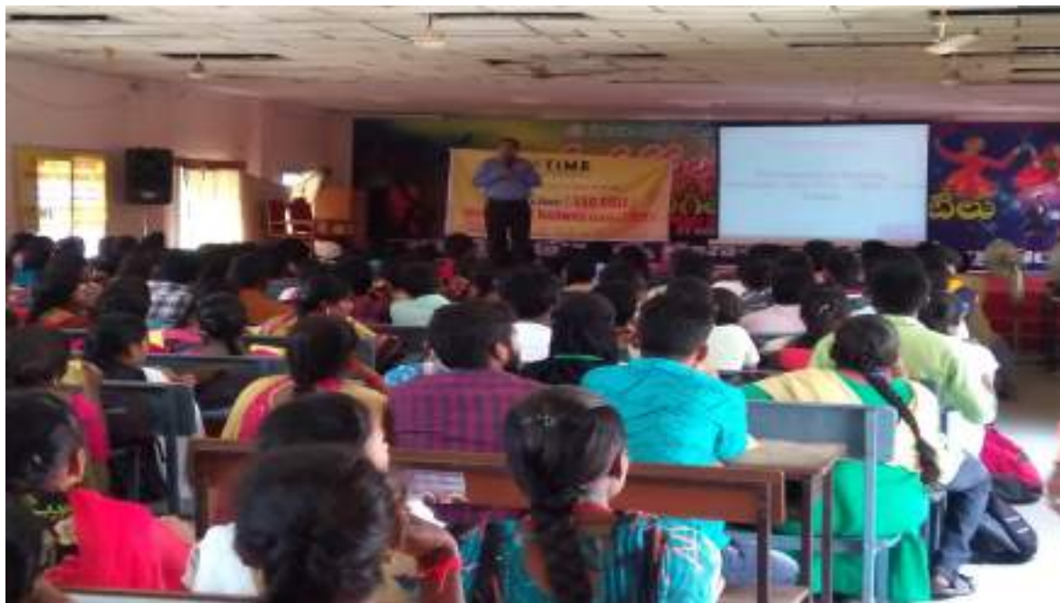
Official from Time Institute explain various competitive exams

TSKC conducted a Awareness Program on How to Crack Bank PO/ICET/RRB Exams on 01-02-2020 in collaboration with Time Institution. In this awareness program officials from TIME institution explain briefly about various competitive exams and tips given on how to manage time exam. MOCK test also conducted. By this program student get an idea of various exams.