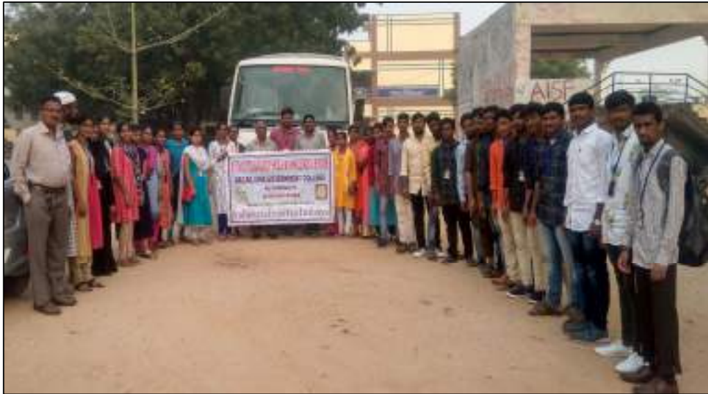
Before starting the journey Group photo with BUS