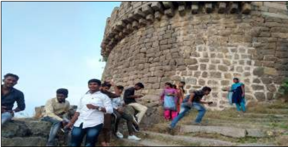
Students eagerly Trecking fort