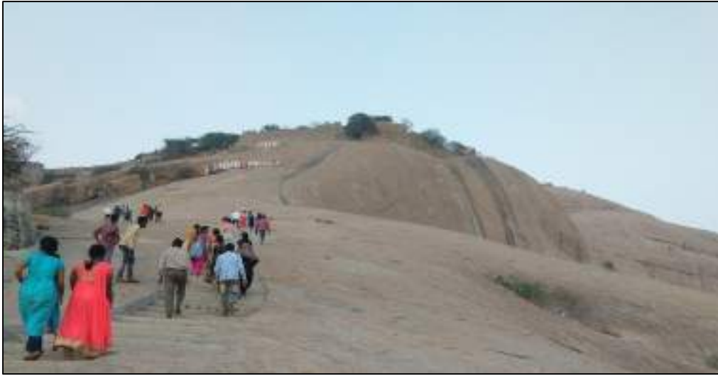
Treking at Monolithic Hill Fort (Historical Visit)