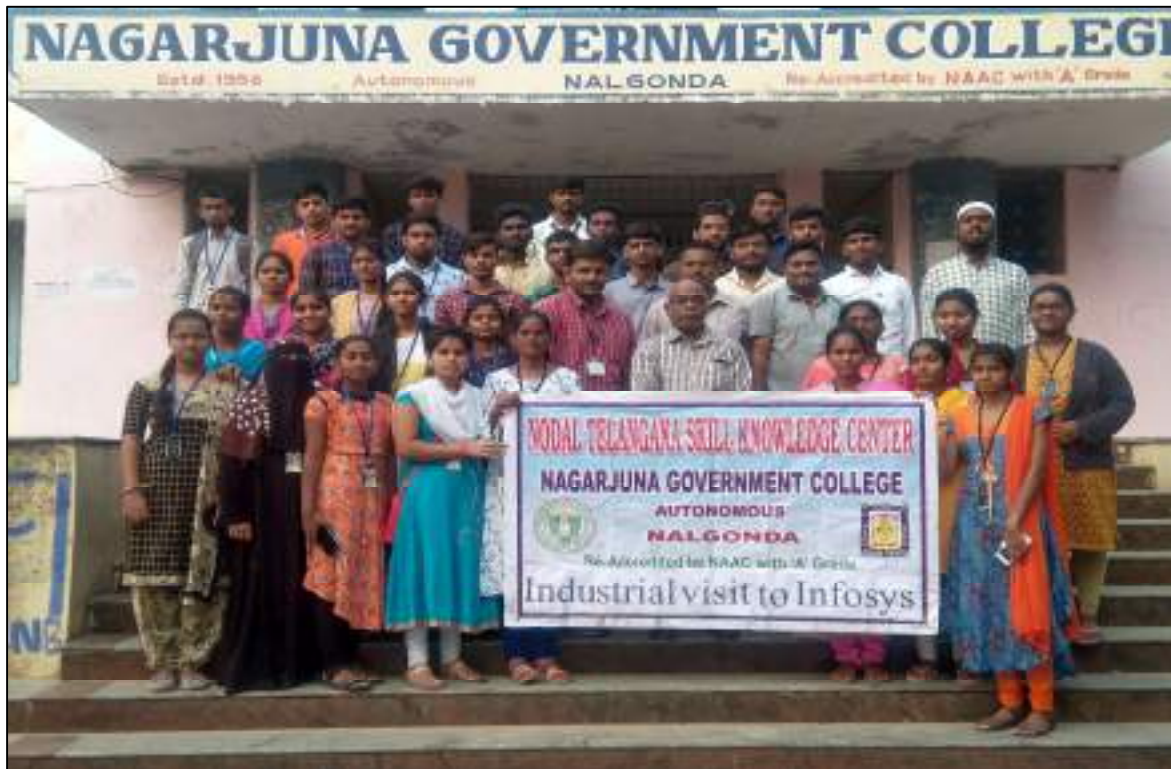
Group Photo before starting the trip

Students also visited Monolithic Historical Bhongir Fort during this field trip.