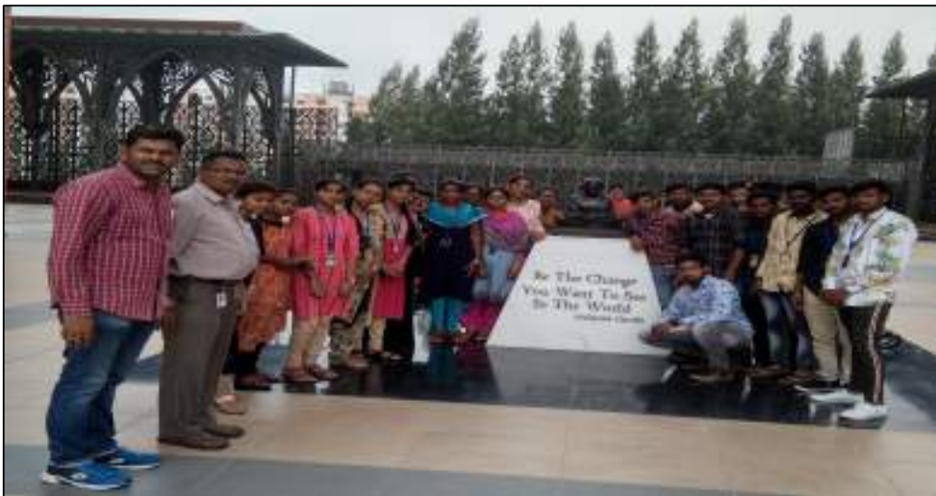
Students PIC with Our Jathipeetha