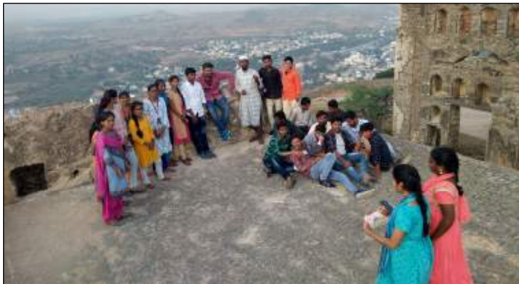
Group Photo on Top of the Fort