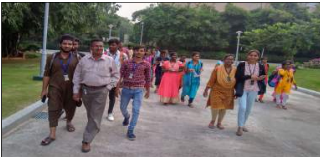
Students eagerly entering into the campus