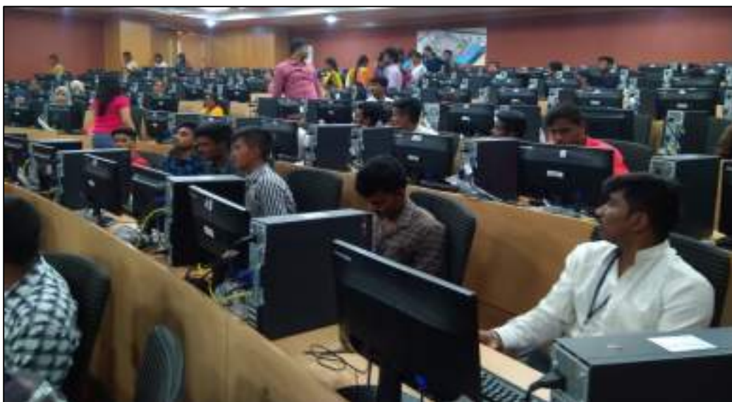
TSKC Coordinator guiding the students