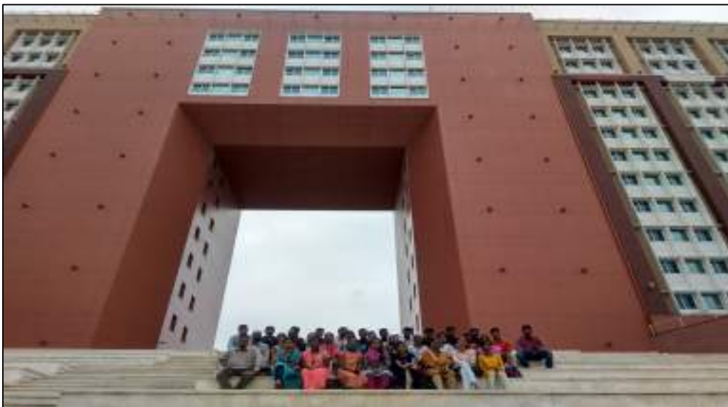
Infosys main Campus