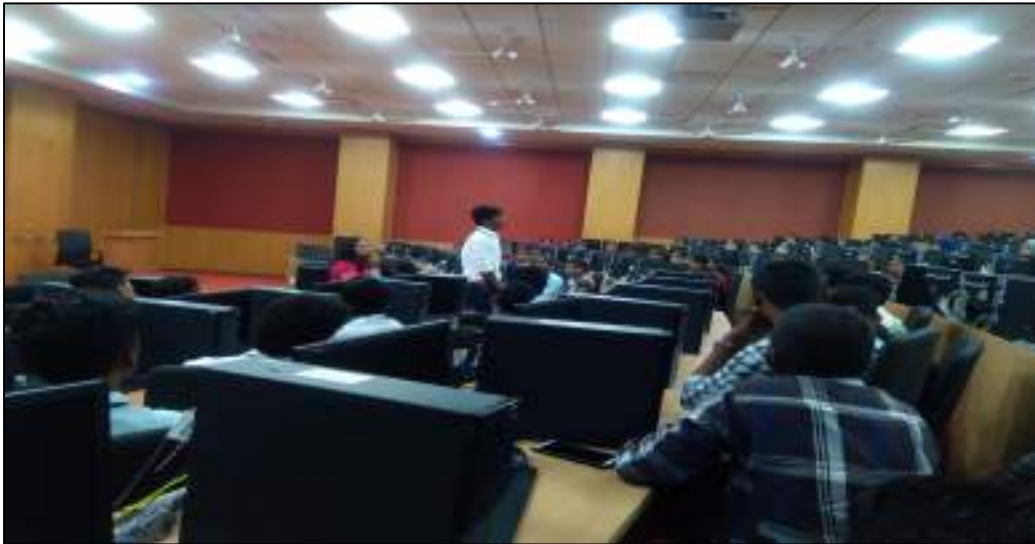
Out Student giving Indroduction @ Infosys Campus