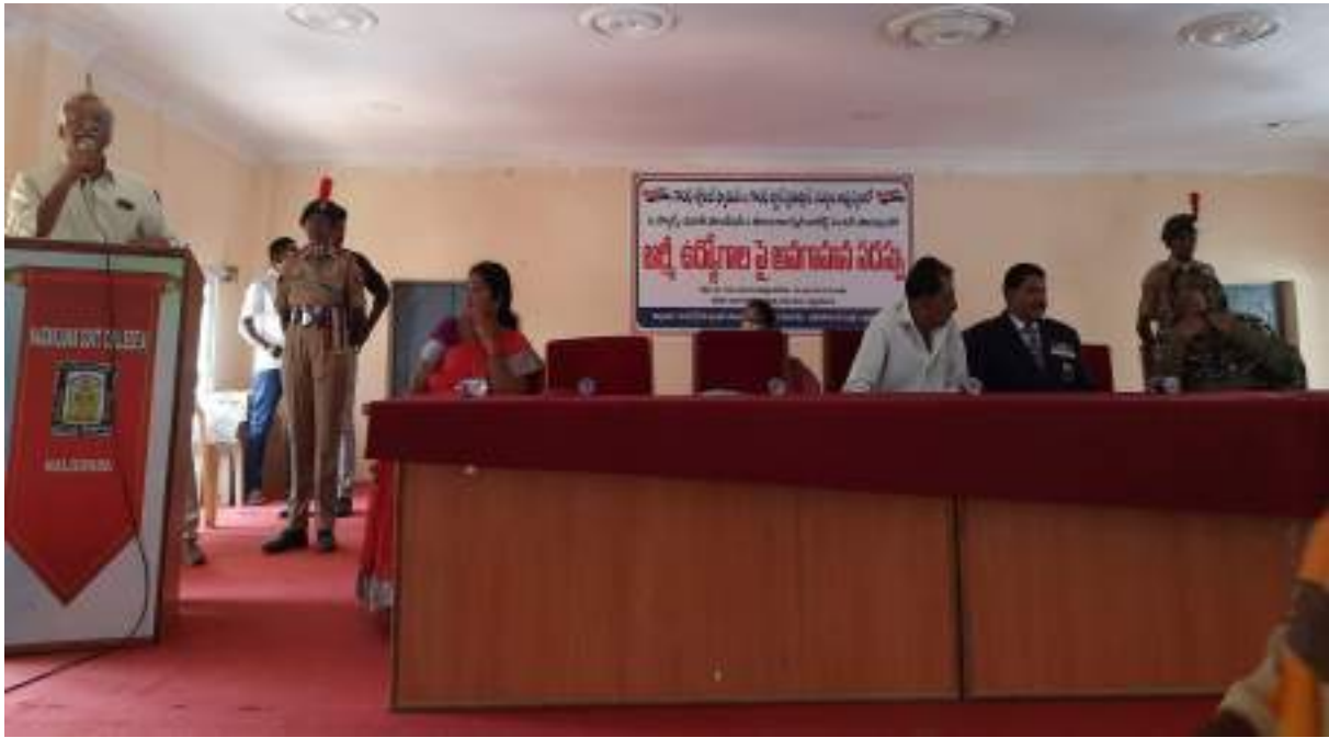
College Alumni motivating the students