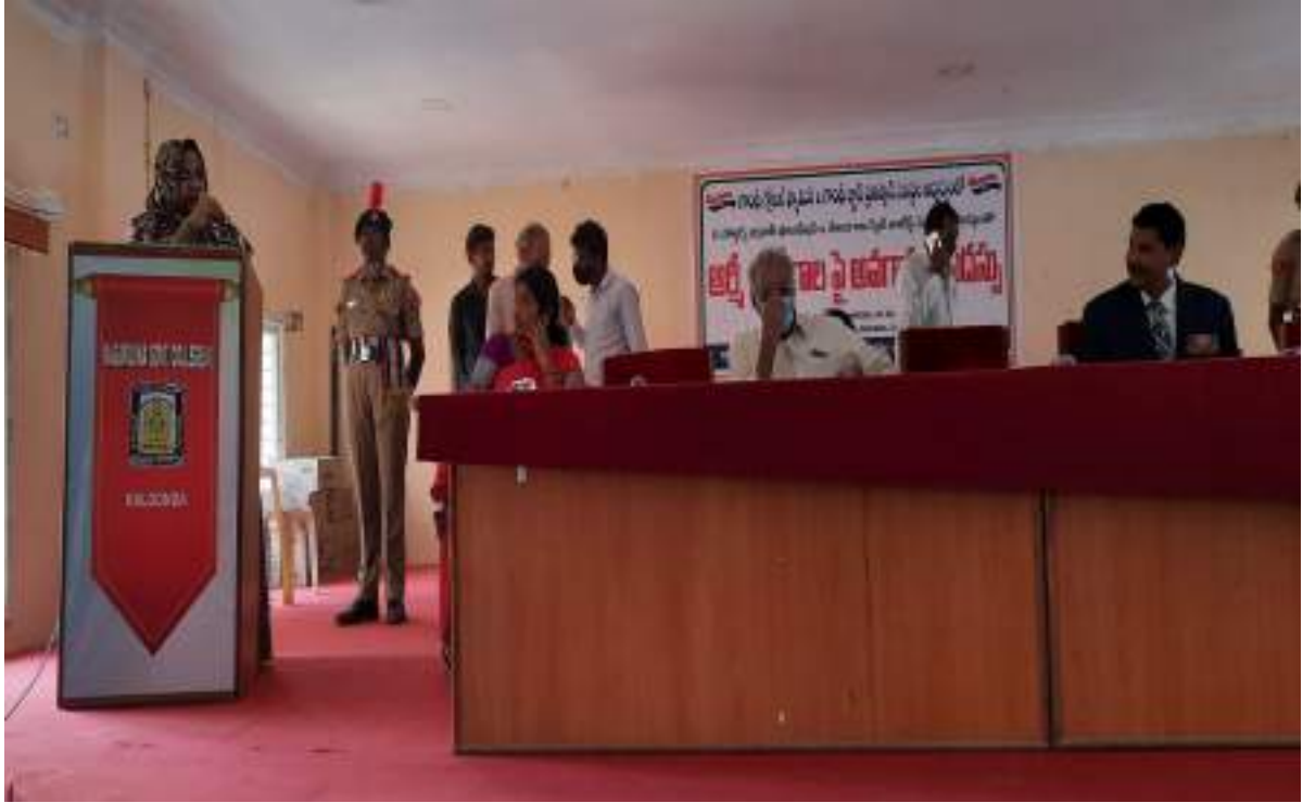
Principal Madam, Inaugurating the Session