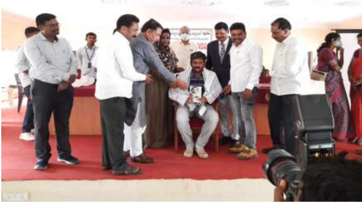
Felicitating TSKC Coordinator for organizing the successful event