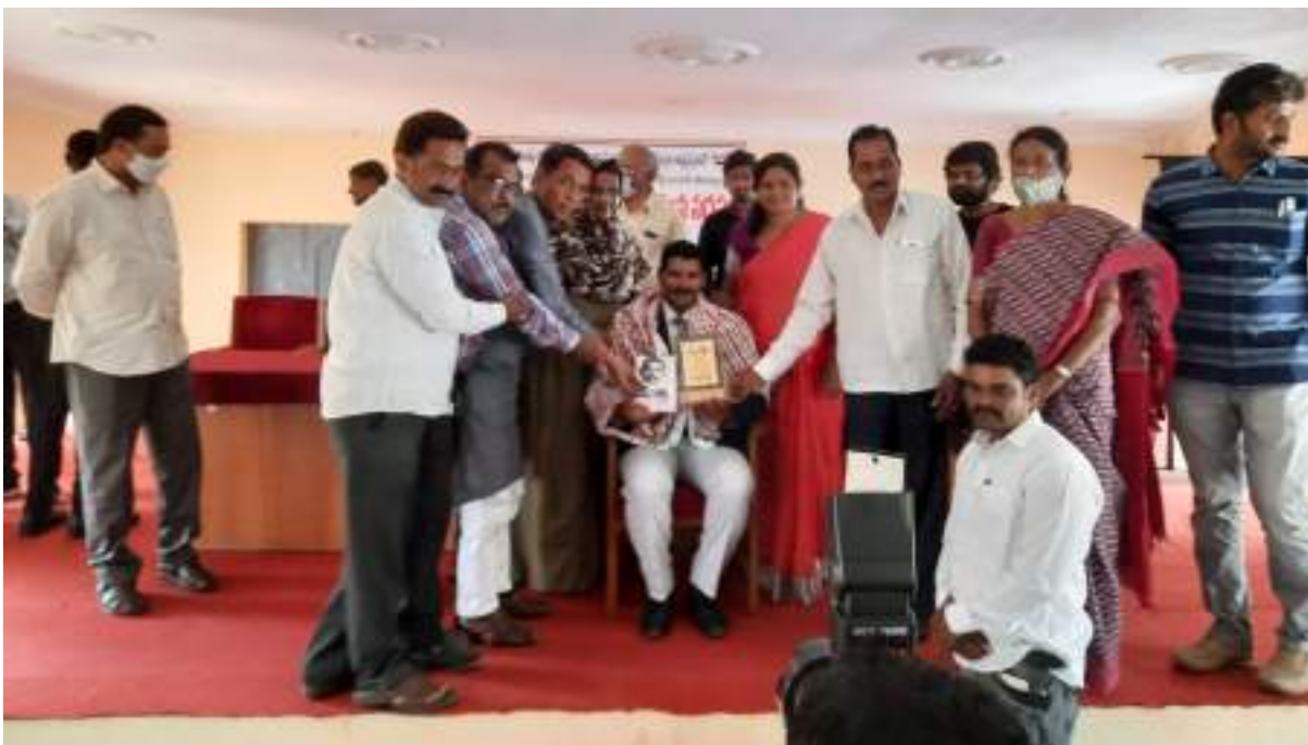
Felicitating Army Kalnal