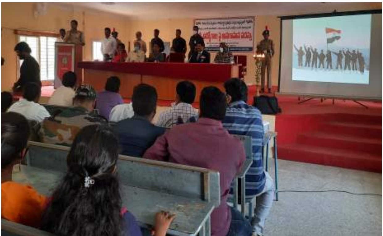
H'able Superintendent of Police Address the students