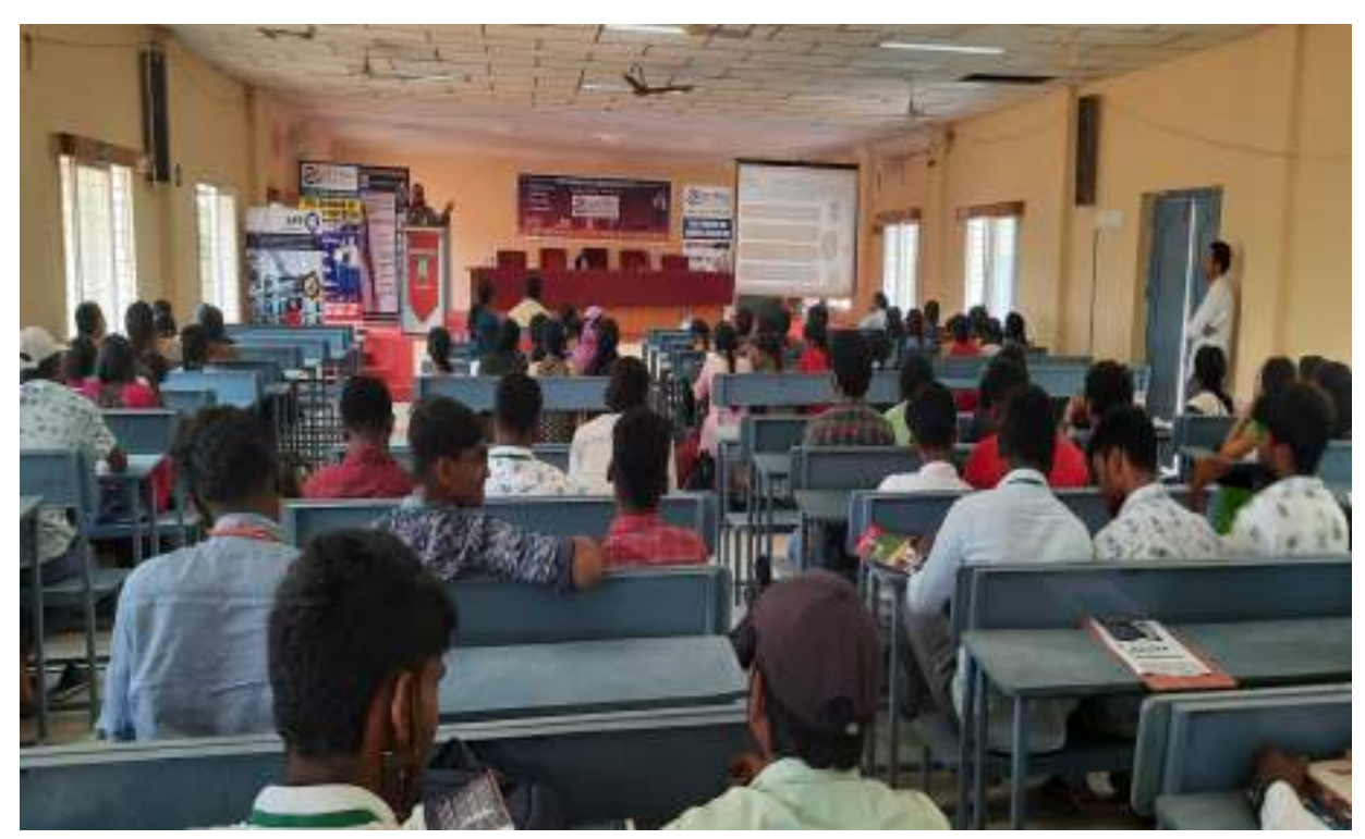
List of Student attended