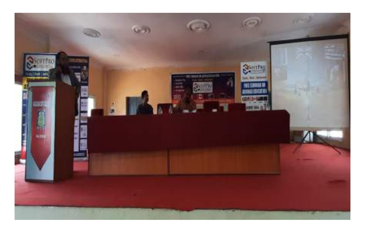
Recourse Person explaining the opportunities in Higher education in abroad