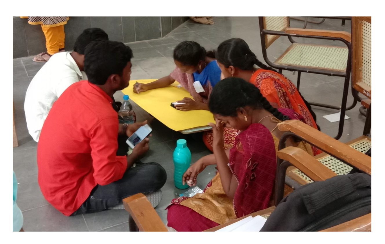
Poster Presentation Preparation