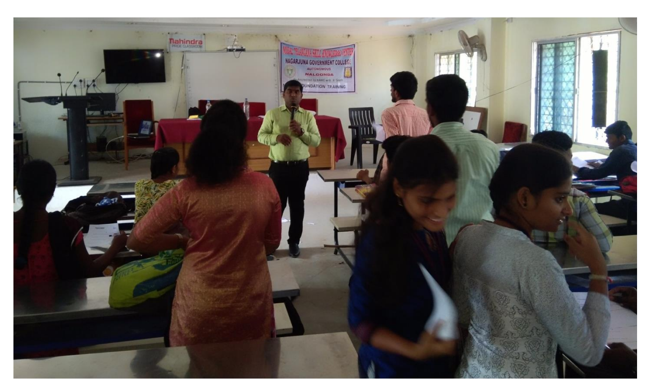
Resource Person conducting group activity