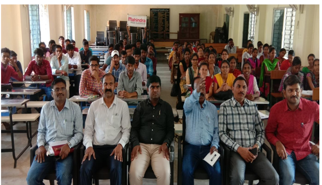
Group Photo with Participants