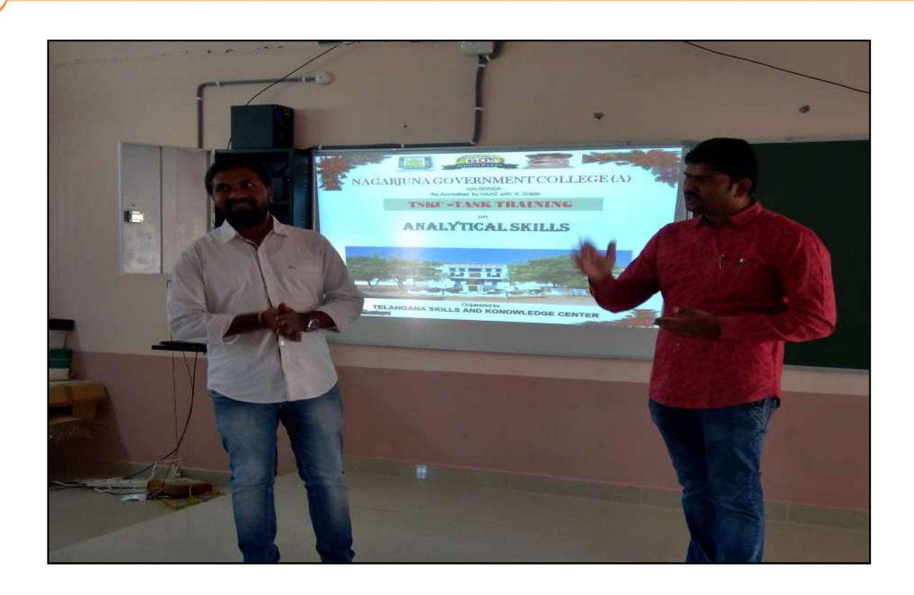
TSKC Coordinator Inaugurates the training session