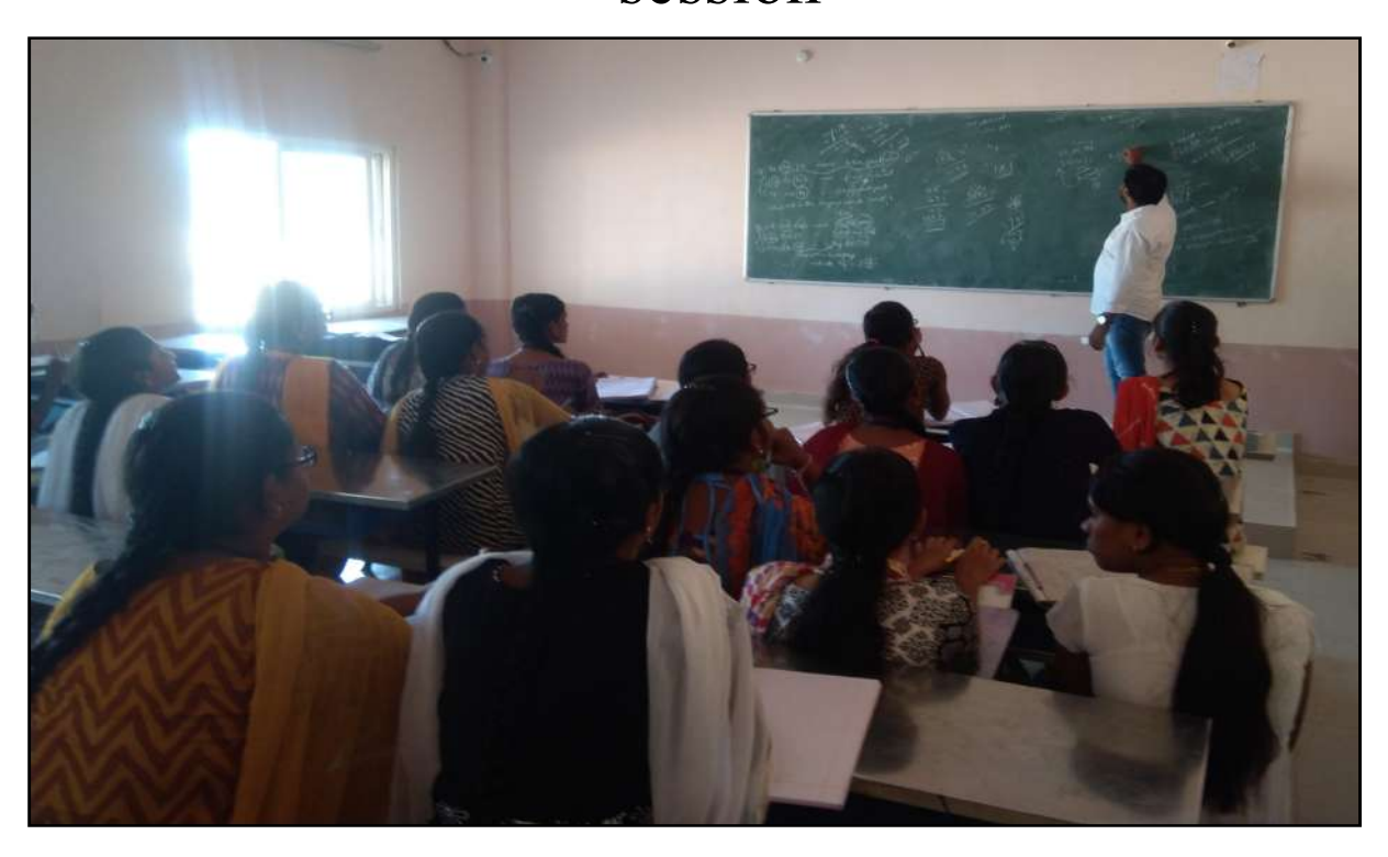
Resource Person teaching Arithmetic and Reasoning Skills