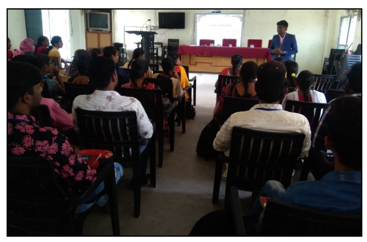
Trainer briefing about the sessions