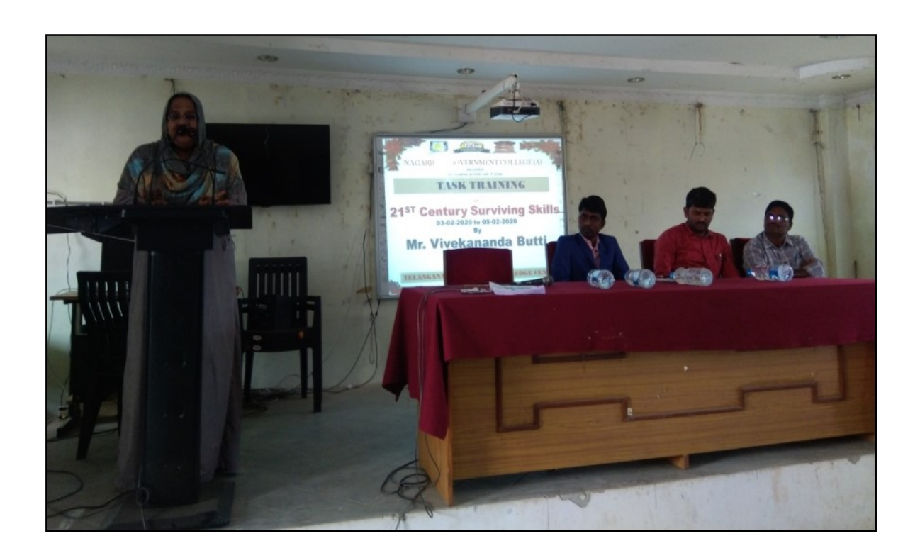
Principal Addressing to the students in the Inaugural