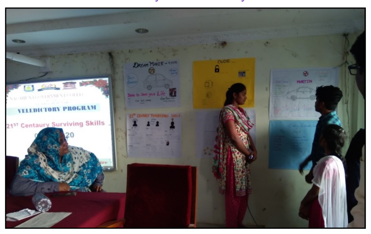
Student Presenting through Poster to Principal