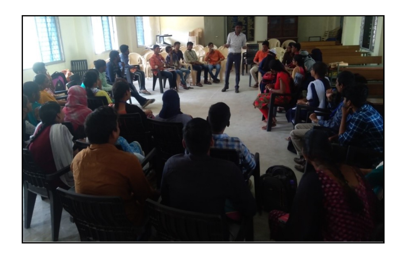
Faculty Centric Activity