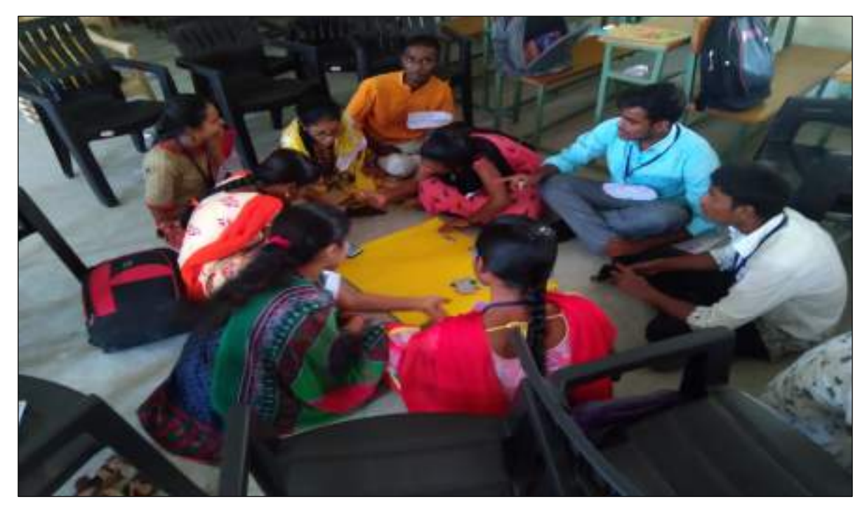
Students preparing Charts for Presentation