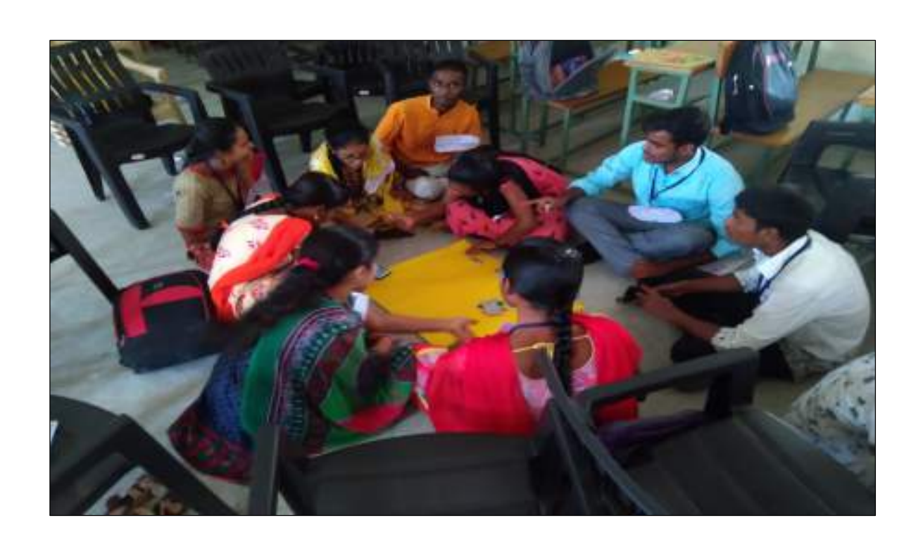
Students preparing Charts for Presentation