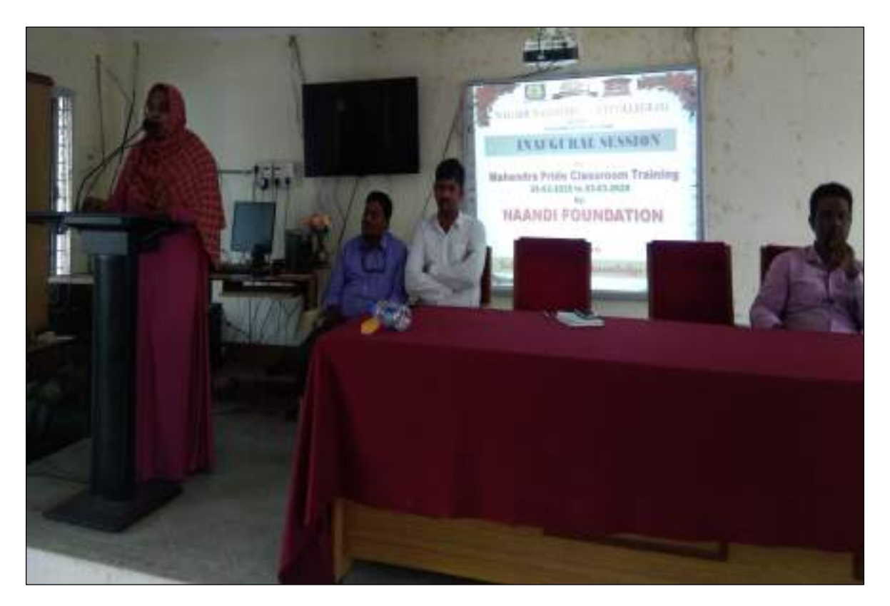
Principal Addressing the Students