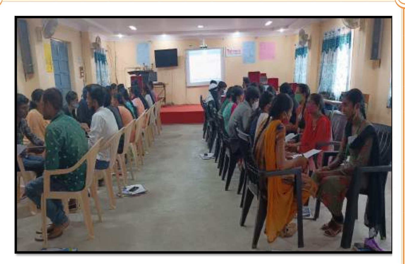
One to One Interview