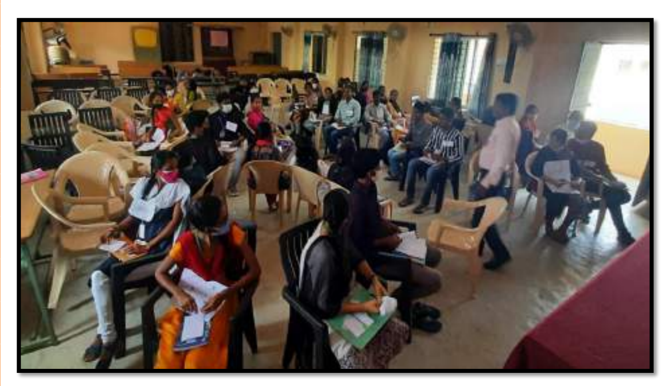
Activity on Communication Skills