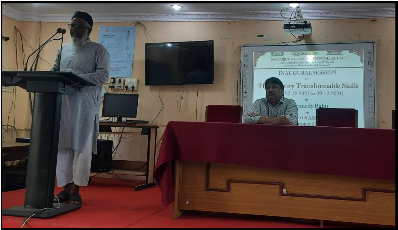
Vice Principal Addressing the student in Inaugural Session