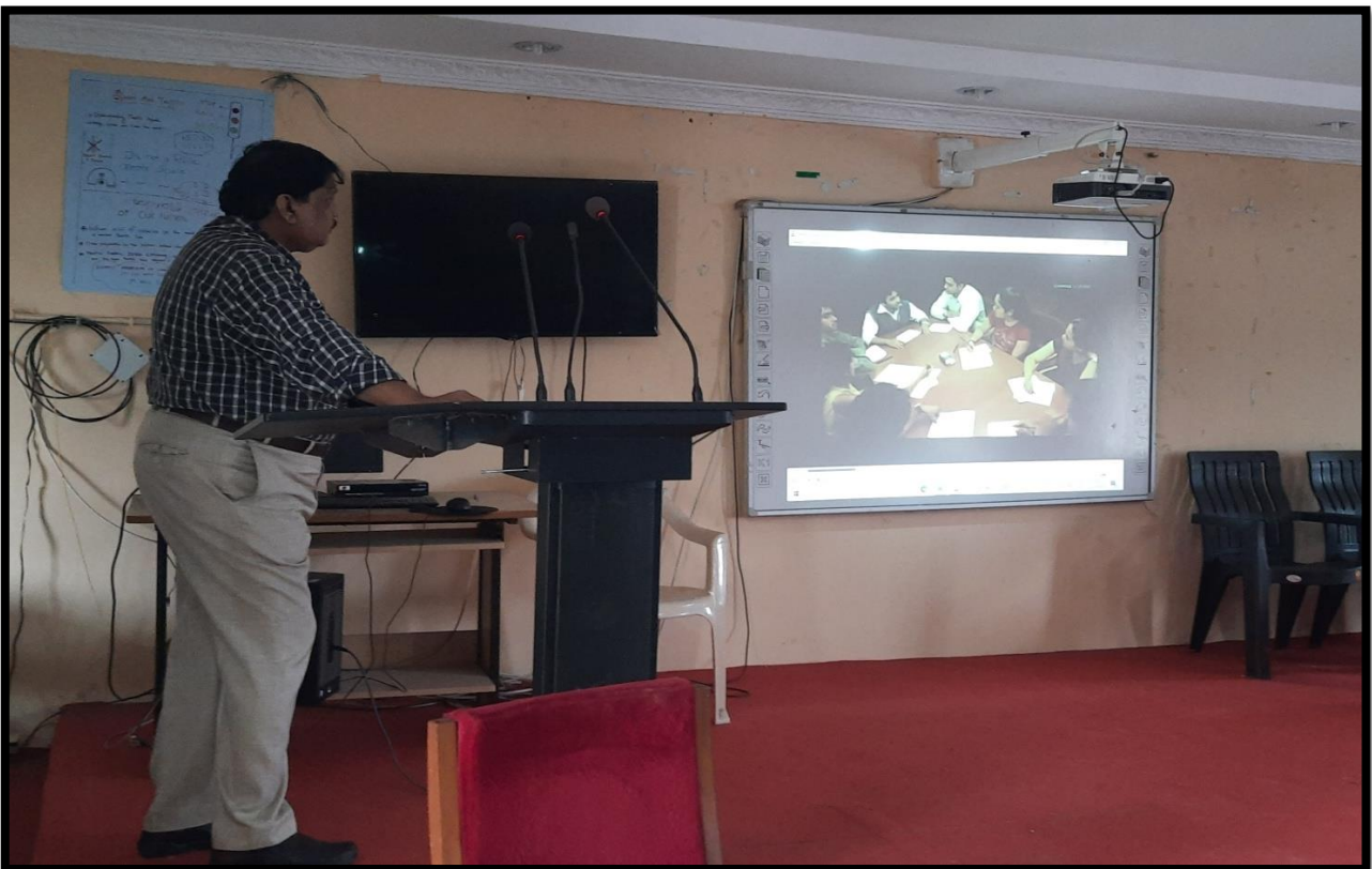
Explaining Group Discussion tips through PPT