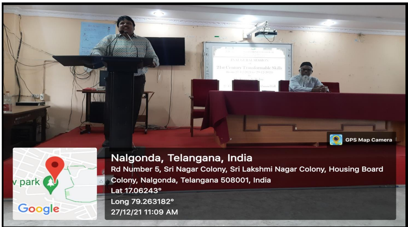
Trainer briefing about training Sessions