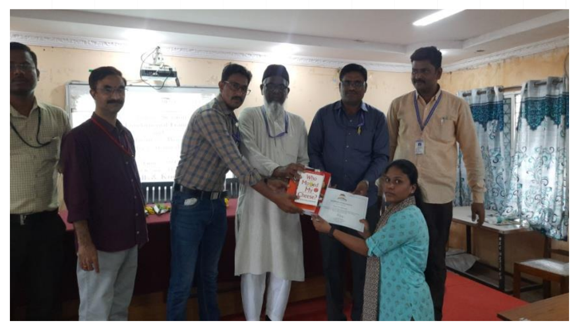
Books & Certificate receiving from Principal