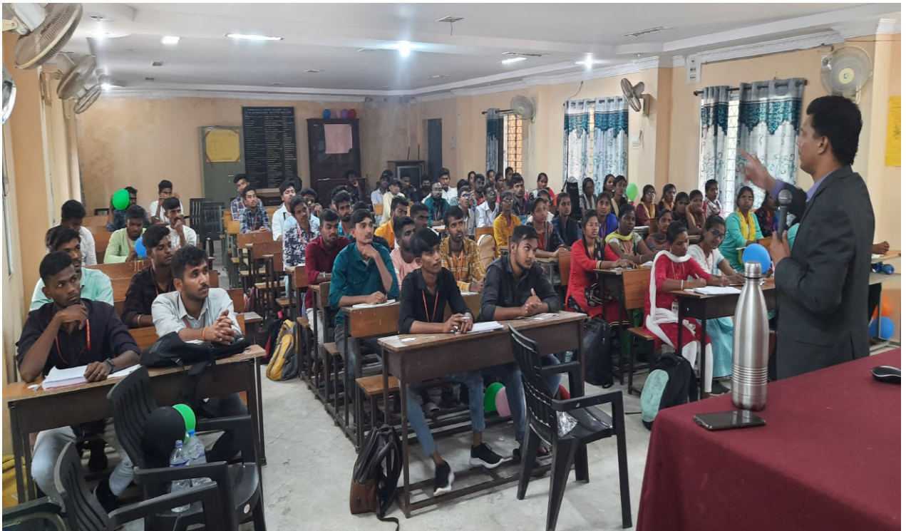
List of Participants