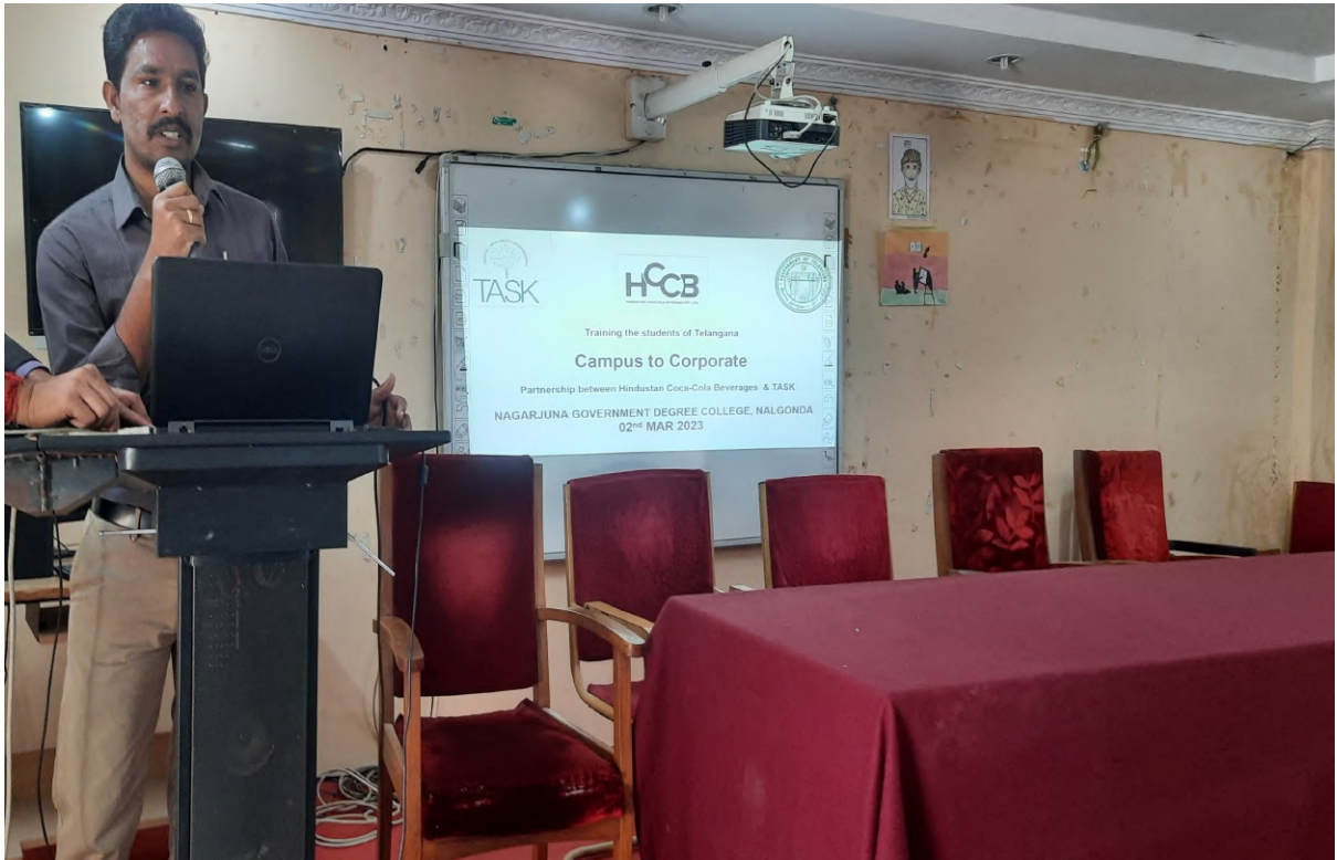
TSKC Coordinator Inaugurating the session