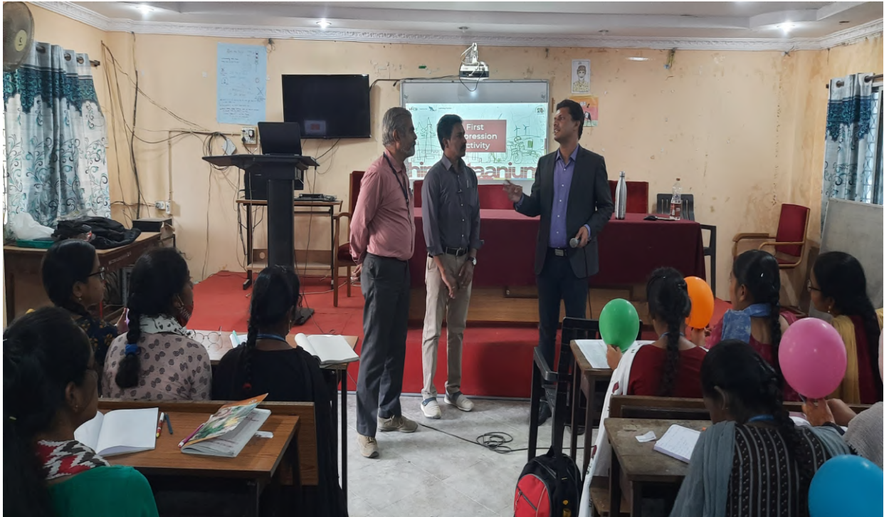
Principal interacting with trainer