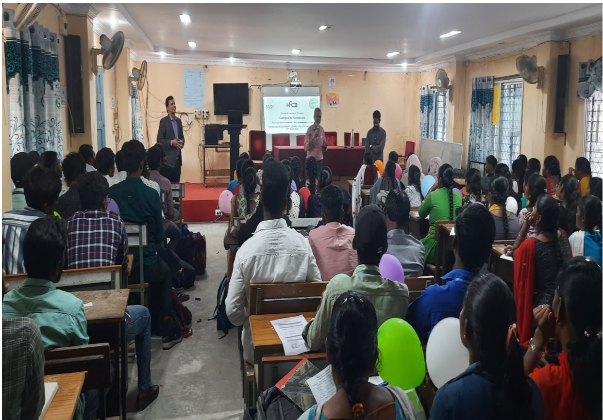
Principal explaining how to get corporate job