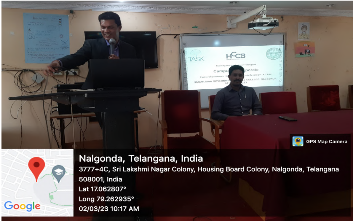
Trainer Briefing about the session