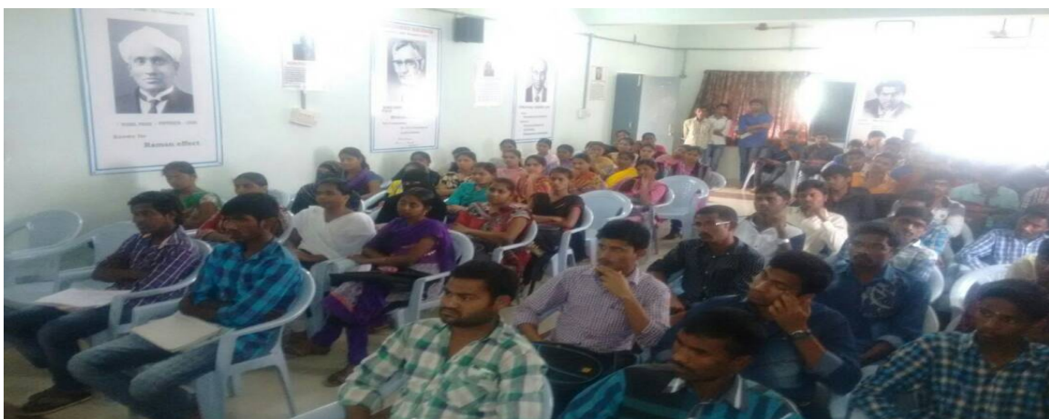
Students are participated in Career Guidance & Counselling Cell Awareness Program