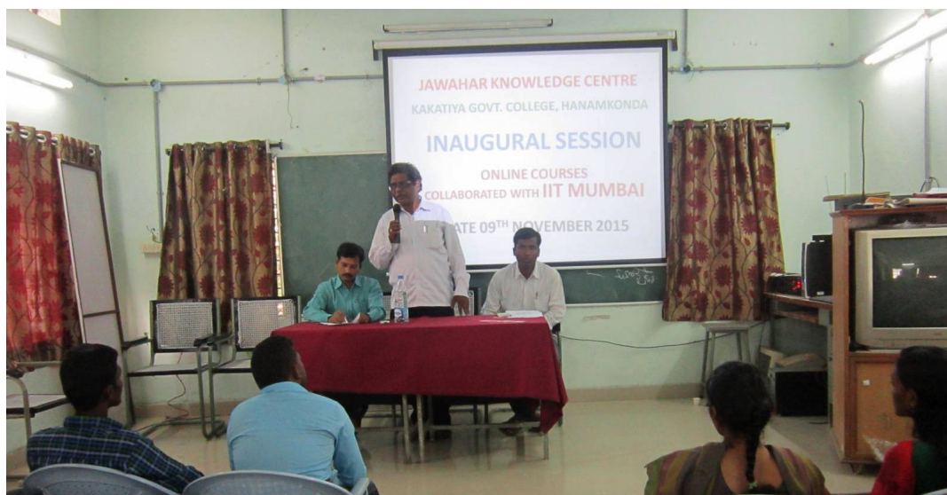
Online Courses inaugural Session Photos