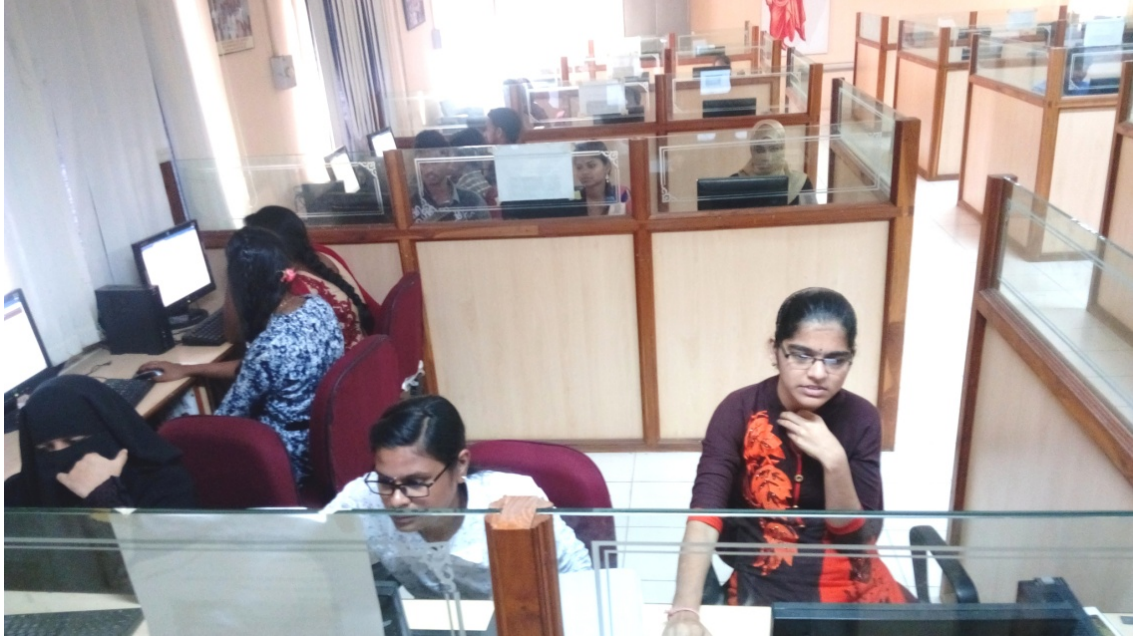
CONDUCTED ONLINE TEST FOR THE STUDENTS