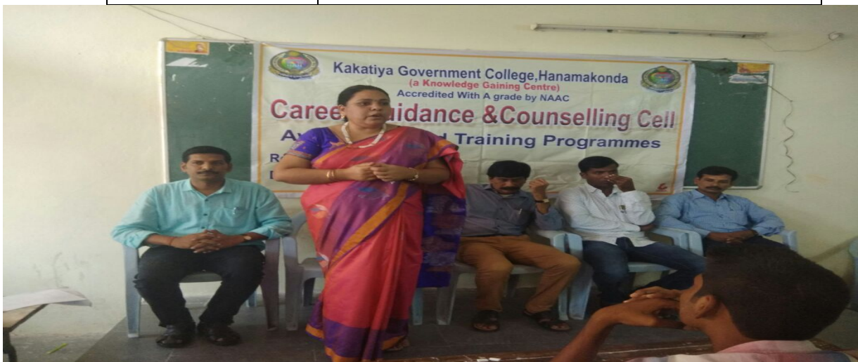
Principal Speech in Career Guidance & Counselling cell awareness programme