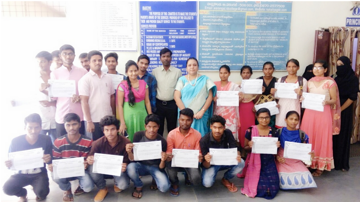
Online course Certificate Distribution to the students