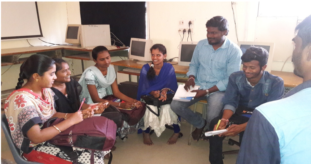
Students participated in group discussion on Global Warming