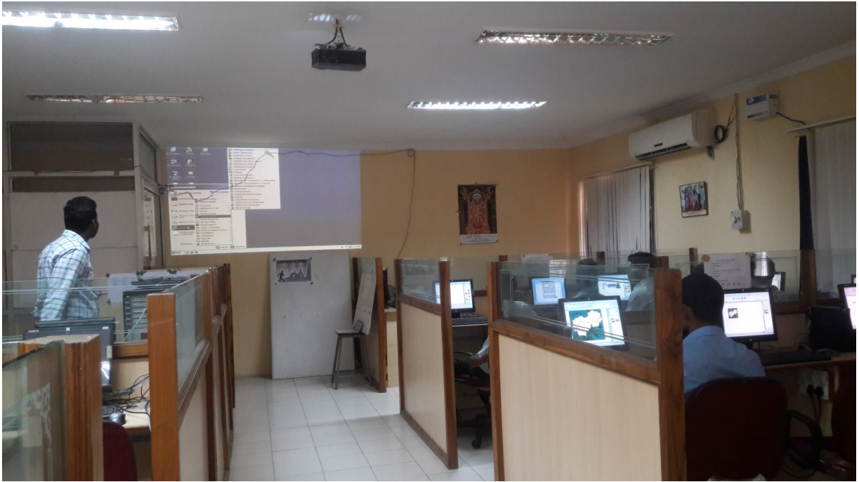
students are giving presentations