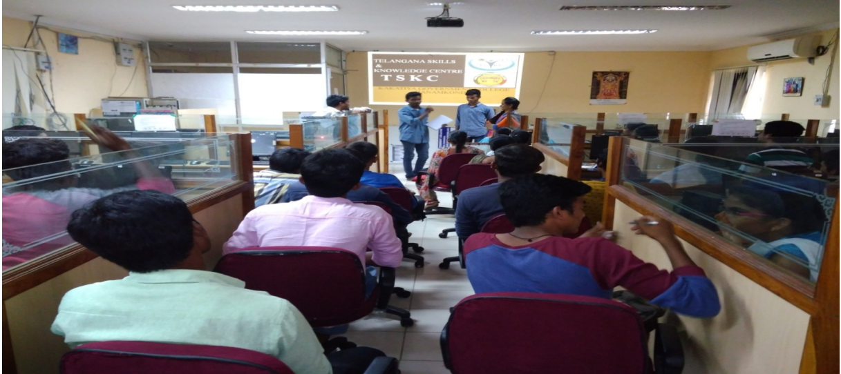
conducting tskc class to the students