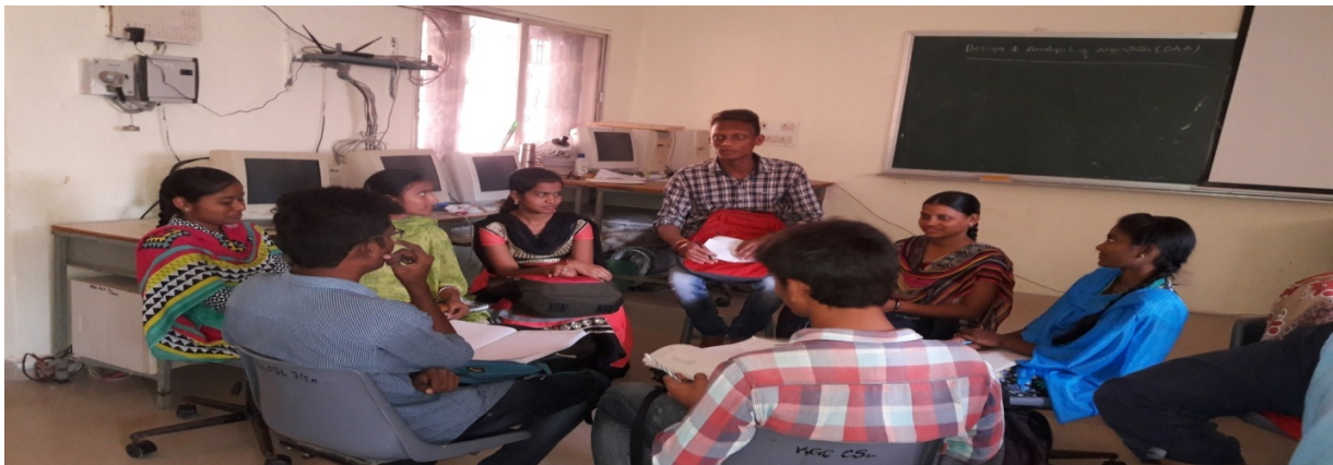
Students participated in group discussion on Global Warming