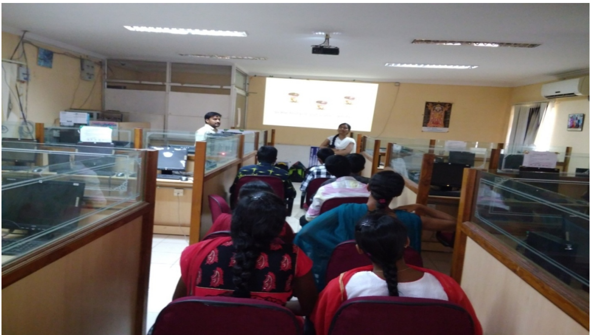
Conducting class to the students