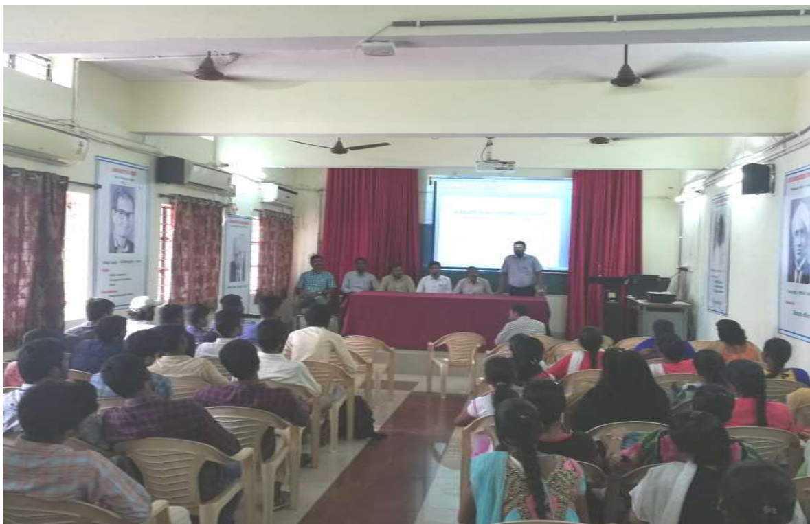
Students participated in TASK Orientation Program