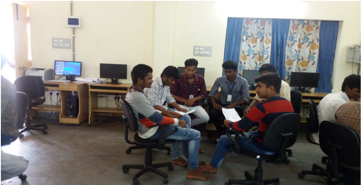
STUDENTS PARTICIPATED IN GROUP DISCUSSION