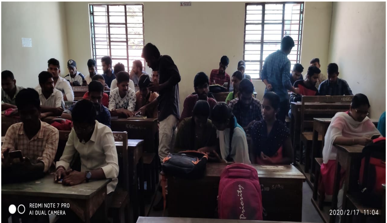
Students Participated in HireMee Assessment