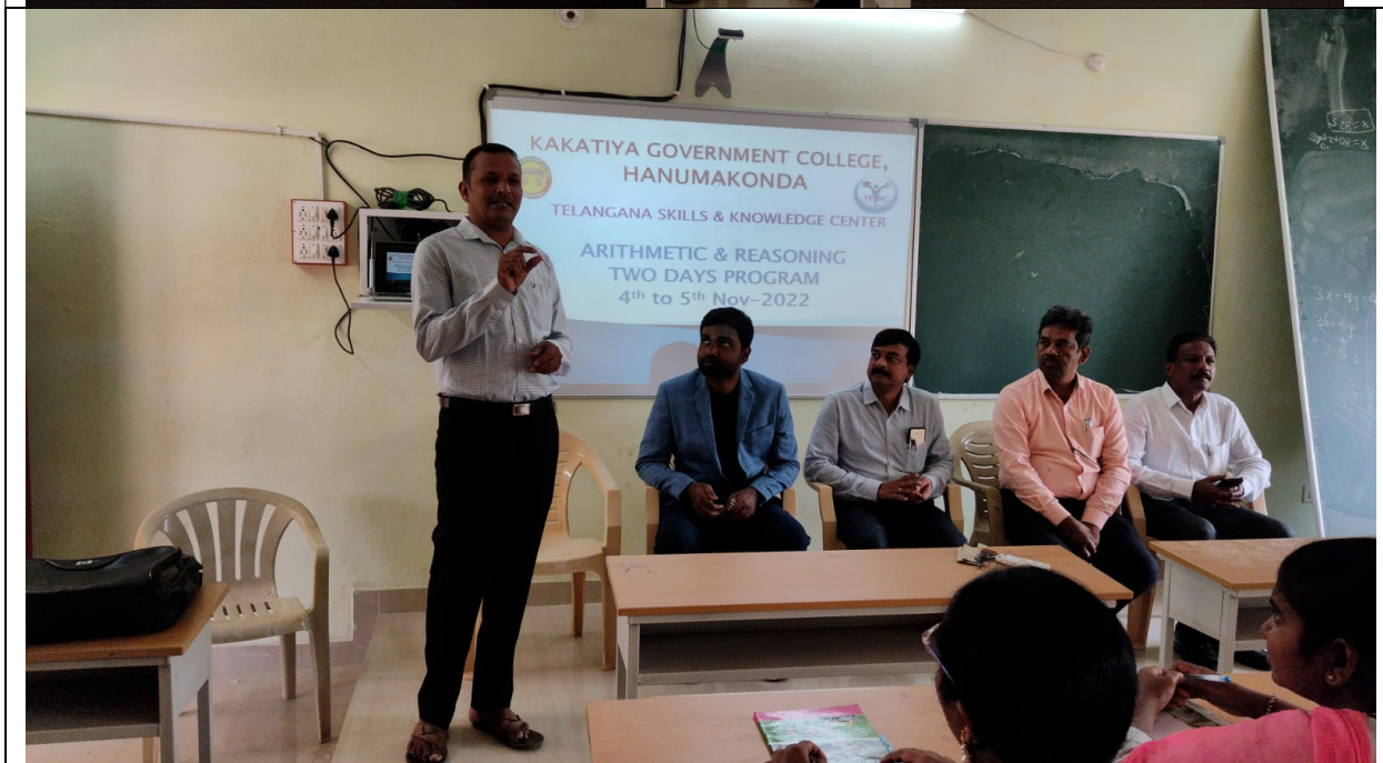
PRINCIPAL AND COORDINATOR SPEAK ABOUT SESSION