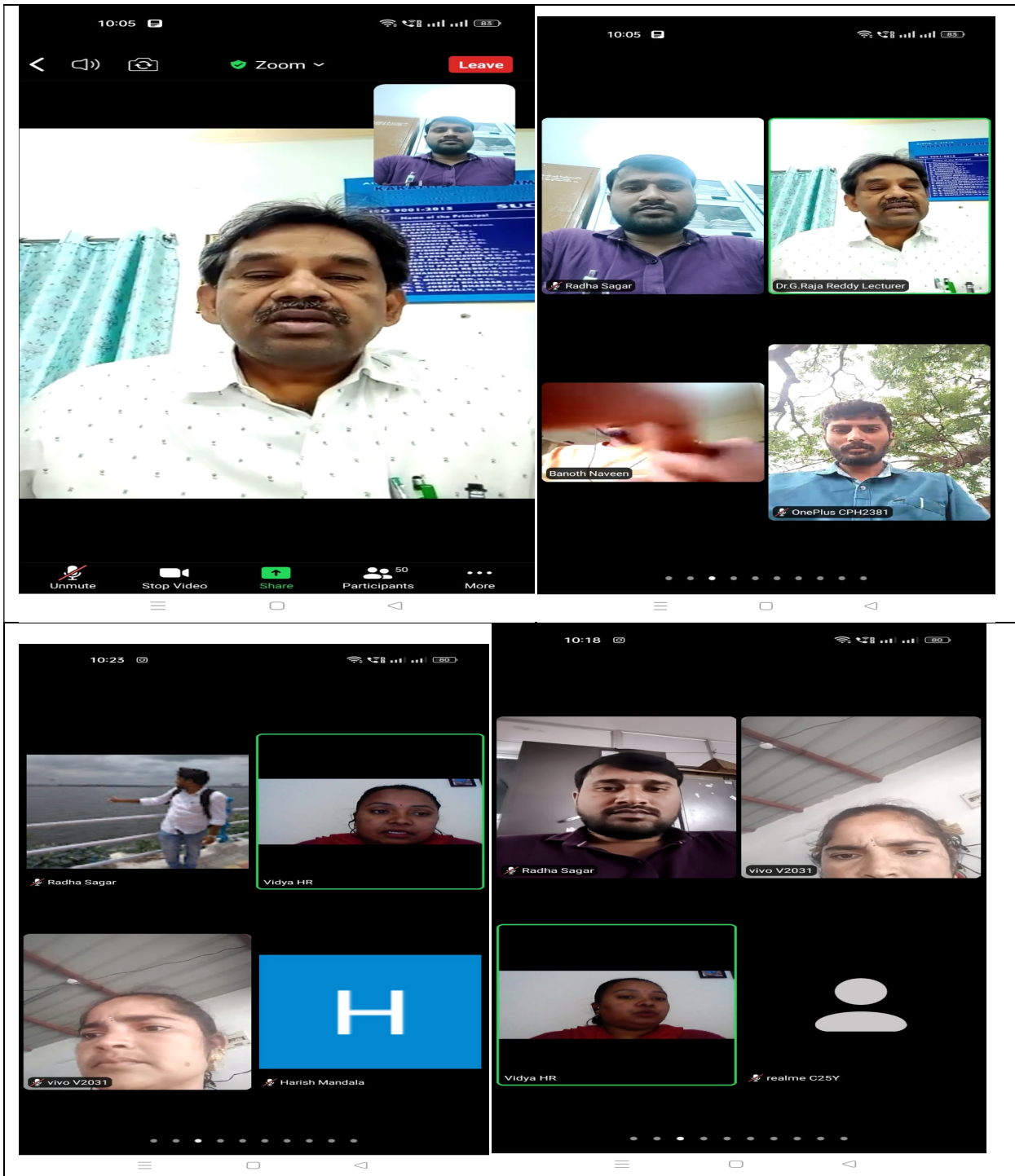
Candidates attended Digital Drive