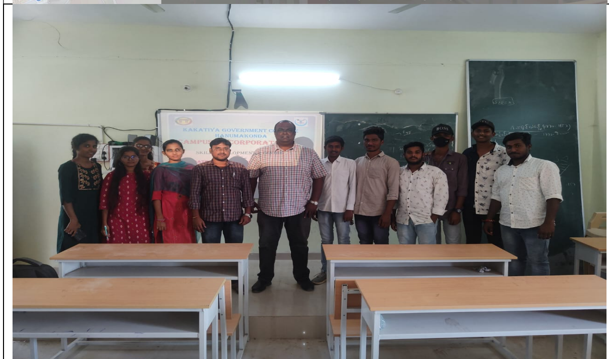
STUDENTS PARTICIPATING ACTIVITY