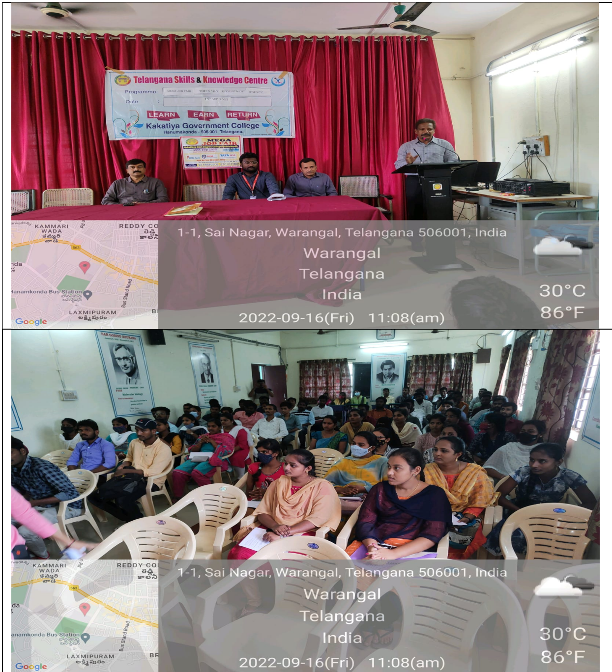
Students attended for job drive

“TSKC Conducted Mega Job Mela By Times Pro Recruitment Agency on 16-09-2022” Total 125 candidates attended and 10 members are selected.