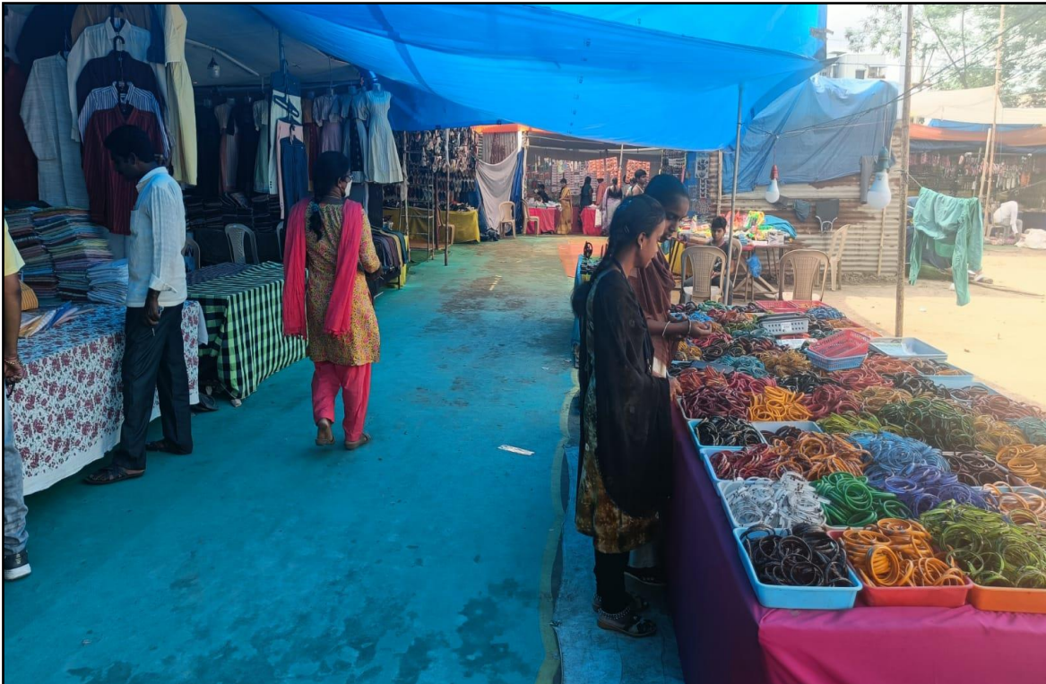
The students observing the products in the bazaar