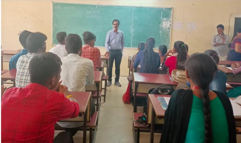
Course in Progress