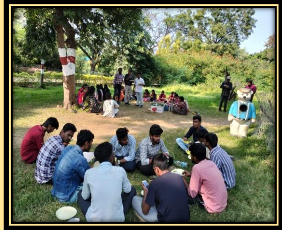
Relishing the visit