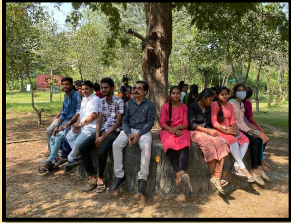
Reflection on the life of Animals